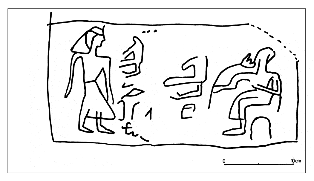
Fig. 2. Figural engravings and hieroglyphic text. Site No. 31/435-P2-3 (Drawing L. Krzyżaniak)