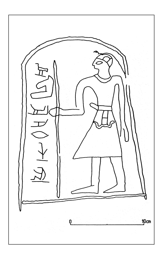
Fig. 1. Figural engraving and hieroglyphic text found on a now loose block of stone. Site No. 31/435-P2-3 (Drawing L. Krzyżaniak)

Another site, No. 30/450-A2-1, yielded an interesting engraving of a victorious Amun-Nakht smiting a Libyan warrior [ Fig. 3 ]; a similar scene, but in painted relief, had been found earlier by the D.O.P. project expedition in a temple situated near the village of Beshendi and dated to the late 1st century BC and 1st century AD. However, most of the petroglyphs found in the investigated area are dated to the Arab/Medieval and post-Medieval times [ Fig. 4 ].