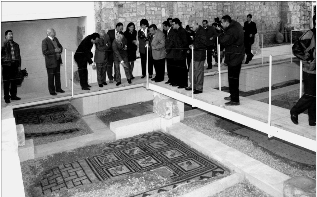
Fig 3. Official opening of the shelter over the mosaics in the "Villa of the Birds"