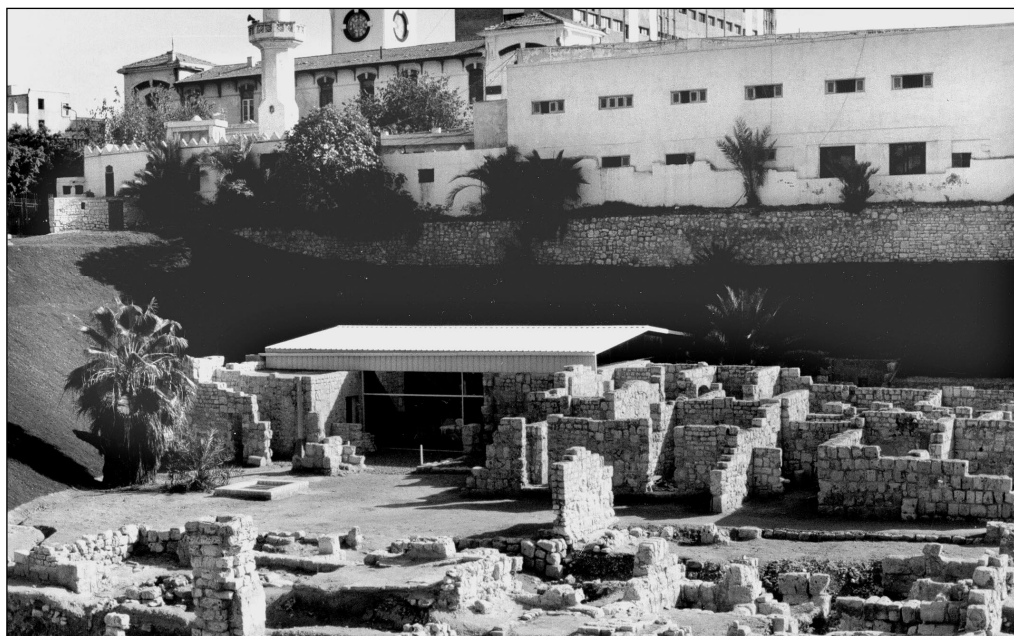
Fig. 1. Slope along the southern border of the area