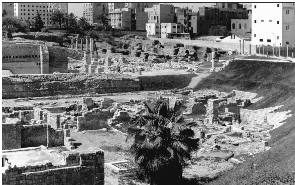
Fig. 2. Slope along the eastern border of the area