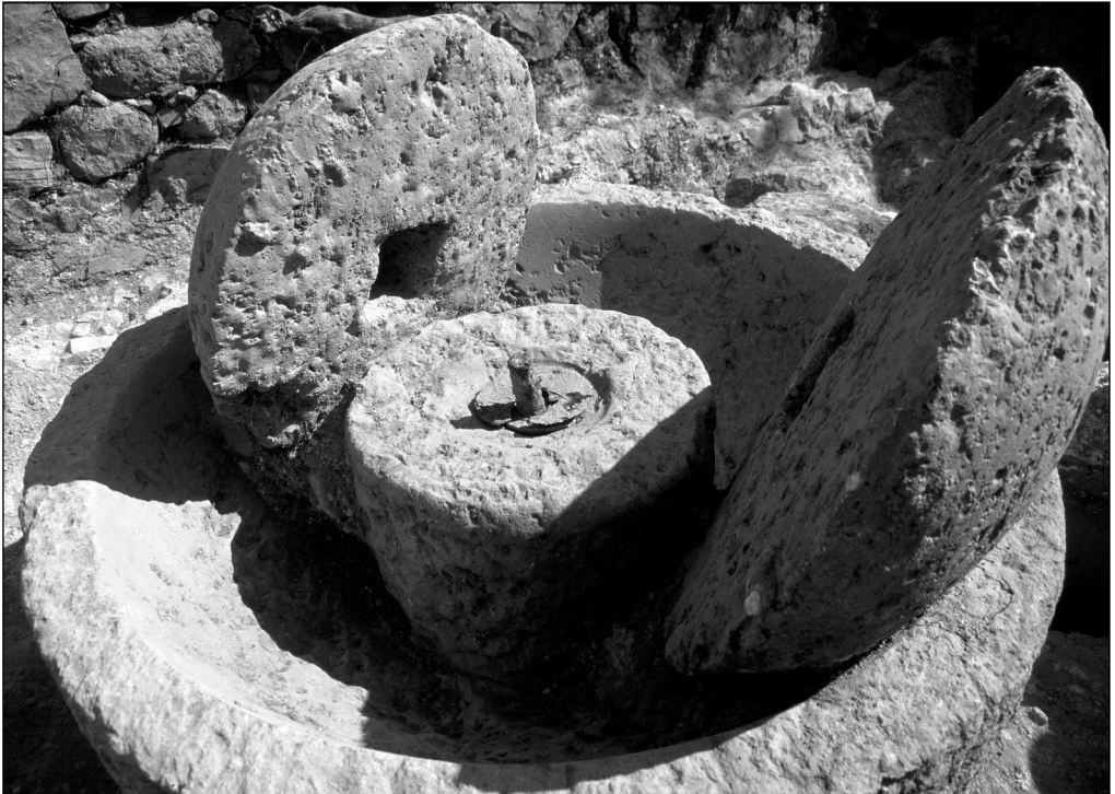
Fig. 5. Oil press E.II – mill with preserved iron pin

A round mill, 1.45 m in diameter, had stood in the southwestern corner of the building ( Fig. 5 ). It preserved the place where the pin for the two olive-crushing stones was mounted. Unexpectedly, the iron pin itself was found in place, set in its bed of molten lead. Two hemispherical