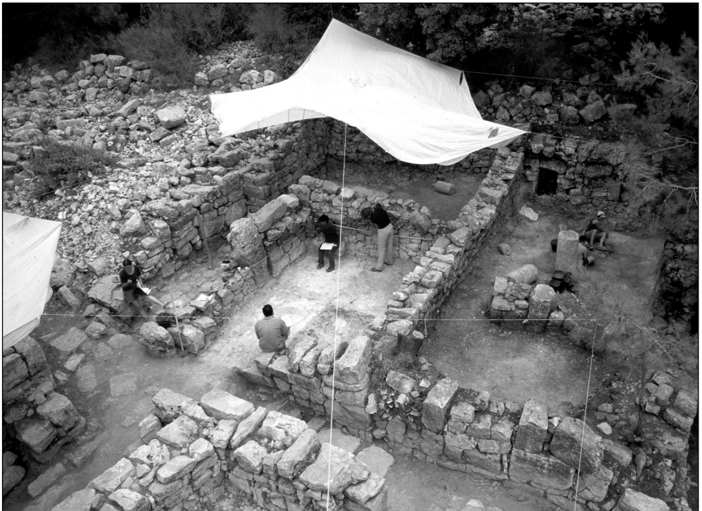
Fig. 3. Rooms E.XI-E.XV during exploration

The northern and eastern walls originated from the same period. There are two rectangular niches in the eastern wall, both placed 0.70 m above the floor. Both measured c. 0.60 by 0.80 m and were c. 0.40-0.50 m deep. Traces of plastering have been preserved inside the left niche. Both