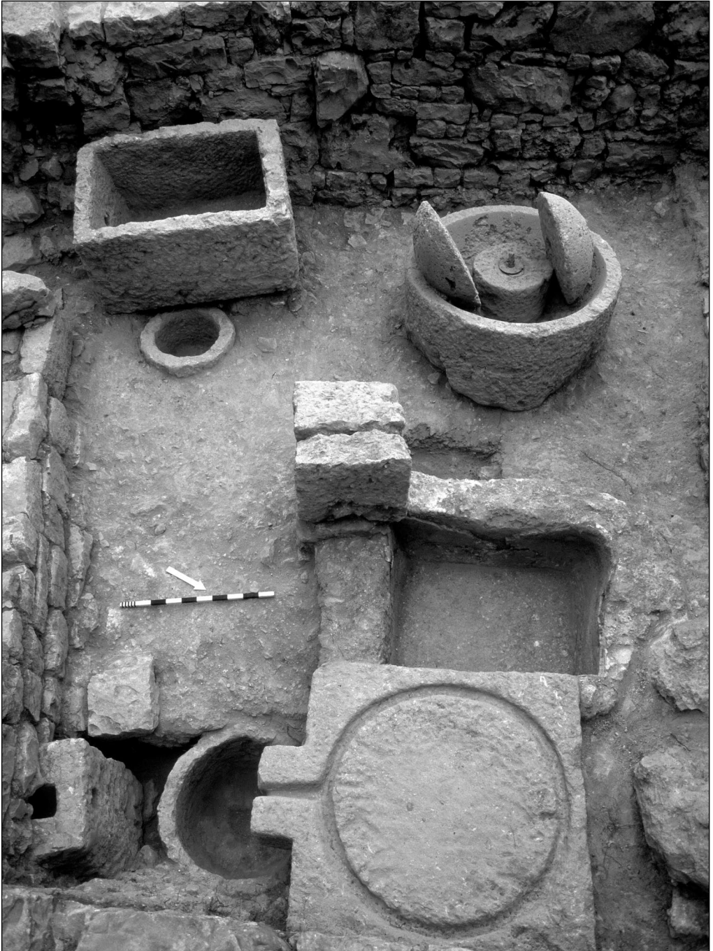
Fig. 4. Oil press E.II