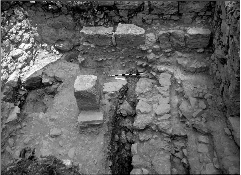
Fig. 2. House E.VII during excavations. Pre-Roman wall visible in the foreground

This rectangular space (about 3.05 by 5.00 m) is accessible from the street through structure E.XV ( Fig. 3 ). The fill, which is some 0.80-0.90 m deep, consists of blocks that have collapsed from the