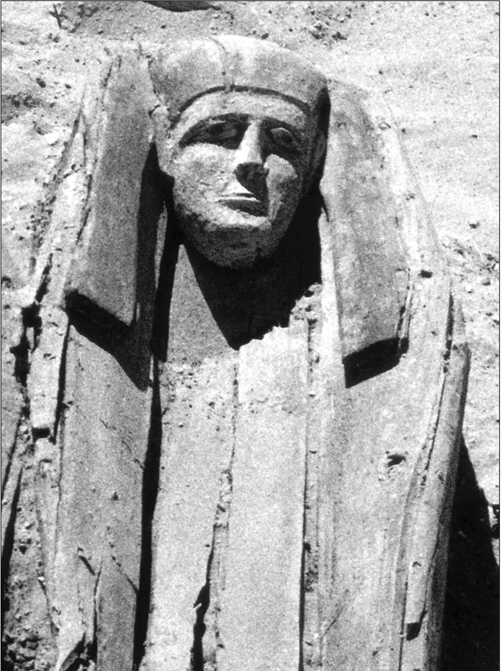
Fig. 1. Wooden anthropoid coffin from Burial 335