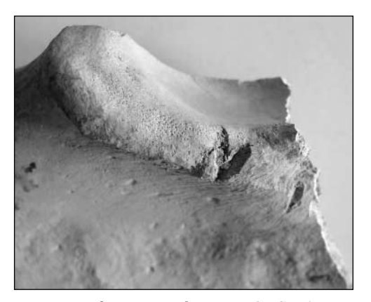
Fig. 13. Chopping marks on camel pelvis bone

The burial had been furnished with grave goods in the form of the meat of a lamb about five months of age, a young sheep and a juvenile camel. The carcasses had been butchered along body parts, retaining as an offering the most attractive cuts from the consumption point of view. The deposited meat comprised the right side of a lamb, left of a sheep and parts of both sides of a camel. It should be noted that the camel and sheep remains were deposited in different