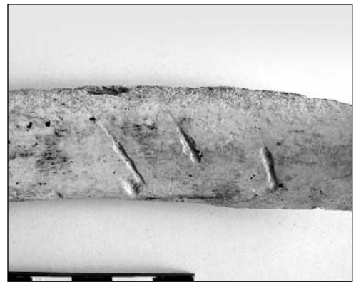
Fig. 14. Cutting marks on camel costa bone