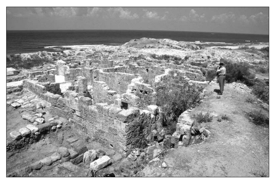
Fig. 1. General view of the site in 1997 with the remains of late antique architecture in the foreground

ancient town of still unknown extent. The present archaeological site [cf. Fig. 1 on p. 424] is just 100 by 150 m and contains the Christian basilica and residential district excavated in 1975 [ Fig. 1 ]. In 1998, illegal agricultural activities in the area immediately to the north of the ruins led to the planting of this area, discovering a mosaic depiction of a river deity in the process.<sup>6</sup> The ancient necropolis lying on terraces another 200 m to the north became