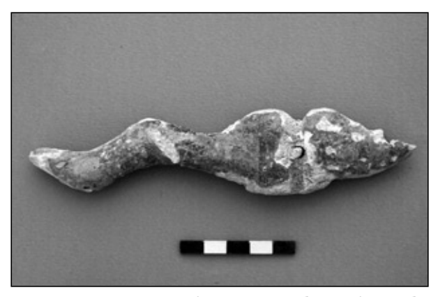
Fig. 2. Fragment of a wooden horn from the crown of Ptah-Sokaris-Osiris

Pharaonic material was found also outside the tomb, mainly as beads, fragments of amulets and ushebti figurines. Among the more important objects of