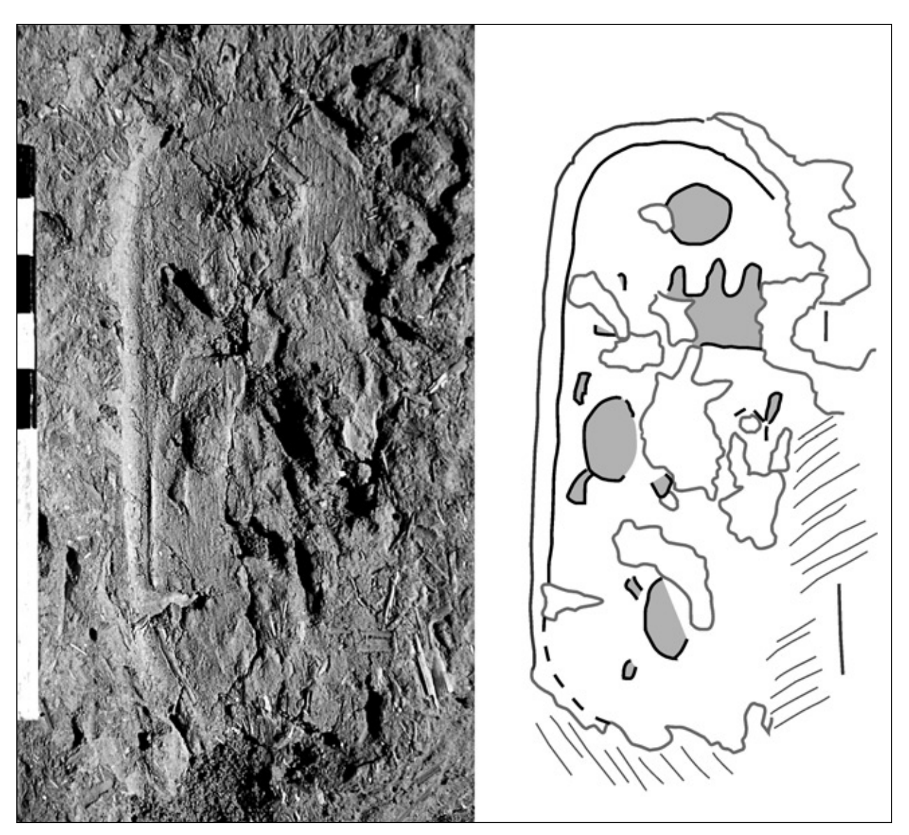
Fig. 4. Stamp on a brick with the name of Tuthmosis IV, Mn-chprw-re (drawing E. Szpakowska)

originally measuring c. 40 x 18 x 12 cm. Occasionally, the presence of stamps was only barely signaled. Recorded stamps fall into one of two types: cartouche or rectangular field with inscribed cartouche. Sometimes a double-feather motif was added to the cartouche. The name on the best preserved stamp can be read despite some minor damages as Mn-chprw-re - Tuthmosis IV [Fig. 4].<sup>3</sup>