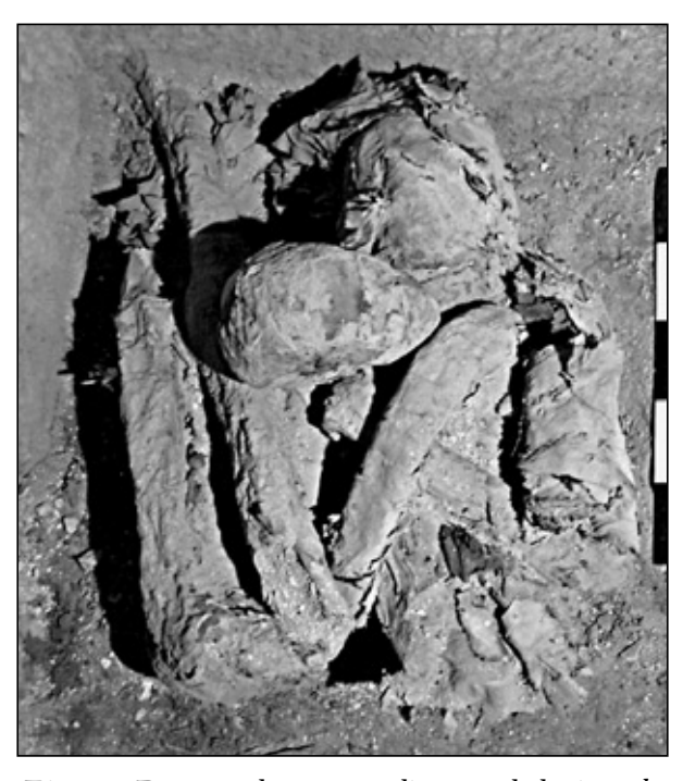
Fig. 3. Damaged mummy discovered during the clearing of the chamber; the head lying on the chest is from another mummy