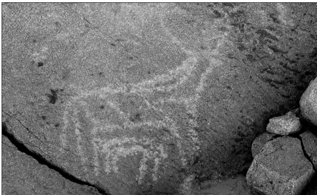
Fig. 6. El-Gamamiya 13. Rock drawings