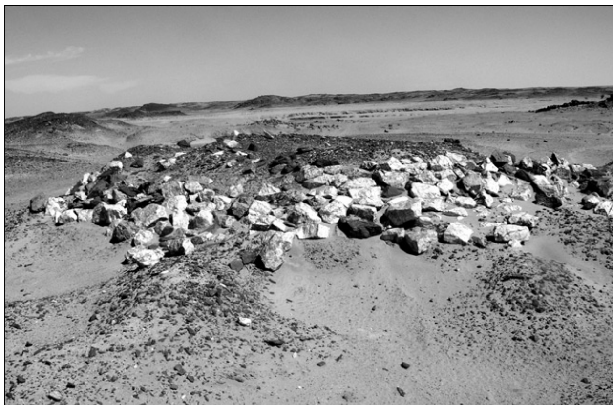
Fig. 1. Es-Sadda 24. Tumulus cemetery