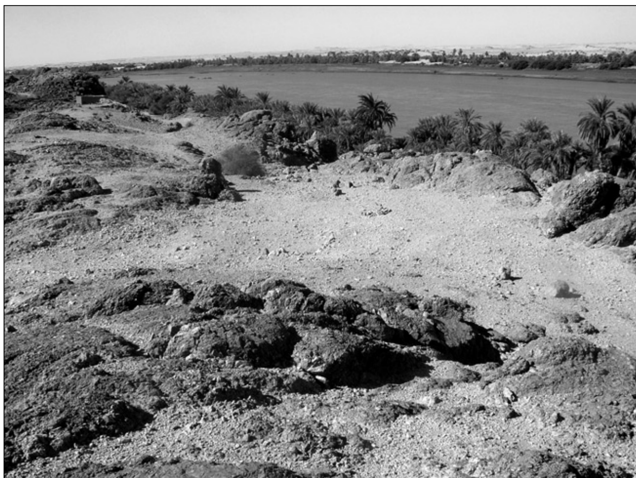
Fig. 2. Es-Sadda 28. Neolithic settlement