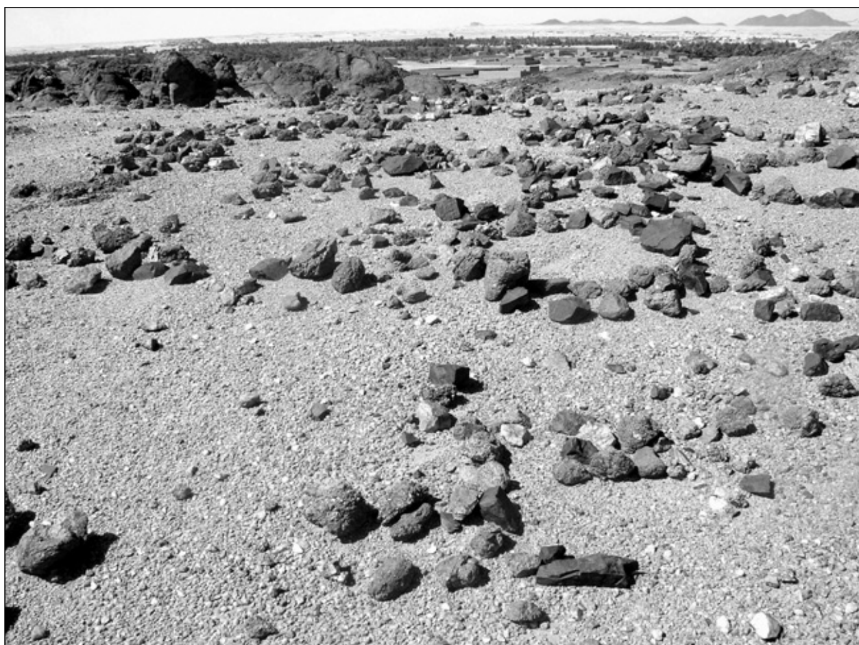
Fig. 3 Es-Sadda 30. Stone rings