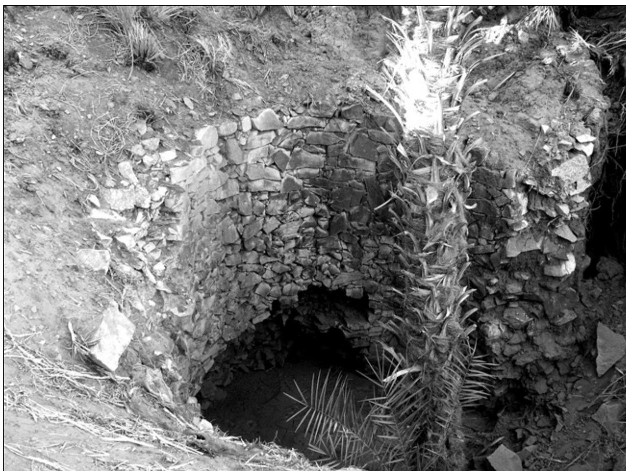
Fig. 4. El-Gamamiya 7. Saqiyah