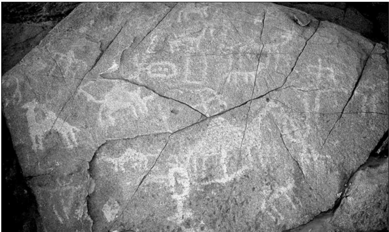
Fig. 5. El-Gamamiya 13. Rock drawings

The tumuli burial fields on hilltops are in all likelihood of Kerma-horizon date. All of the tombs were built of stone blocks and are about 3 m in diameter.