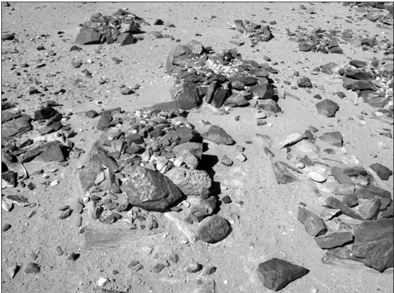
Fig. 8. Shemkhiya 17. Box-graves cemetery