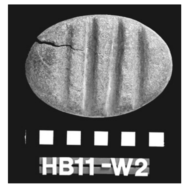
Fig. 3. Two oval stone pieces with grooves from the neighborhood of T168