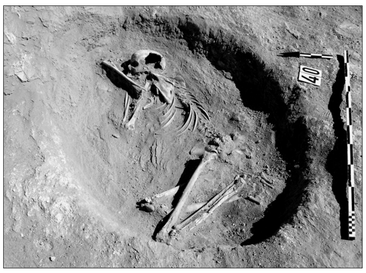
Fig. 2. The burial in Tumulus 40