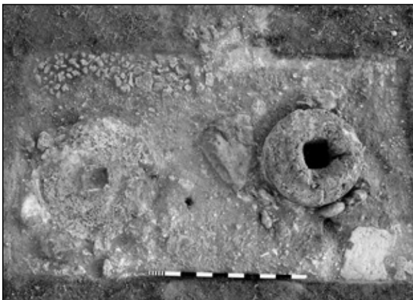
Fig. 6. Bases of the altar screen posts in the southwestern (left) and northwestern part of the nave