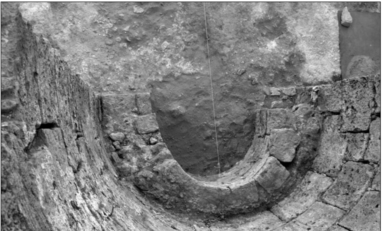
Fig. 3. Interior of the apse with the synthronon. View from above