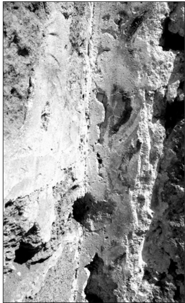
Fig. 9. Fragmentarily preserved painted decoration from a room to the south of the church

The church in Jiyeh was indubitably one of the biggest of the currently known Byzantine churches in Phoenicia Maritima. Unfortunately, the only sources to record anything about its chronology are two inscriptions now in the collection of the Palace Museum in Beiteddine. One of these is dated to AD 506 and commemorates the laying of a mosaic floor in the baptistery of the basilica (still not located), the other comes from the narthex and is dated to AD 595. 3