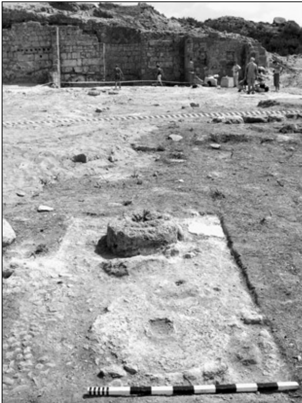
Fig. 4. View of the church nave from the west. Bases of the altar screen posts in the foreground

tangular openings forming a horizontal line. These are the sockets for mounting the wooden beams of a presumed roof or, and this is more likely, an upper floor. Nothing can be said at this point about the dating of this feature.