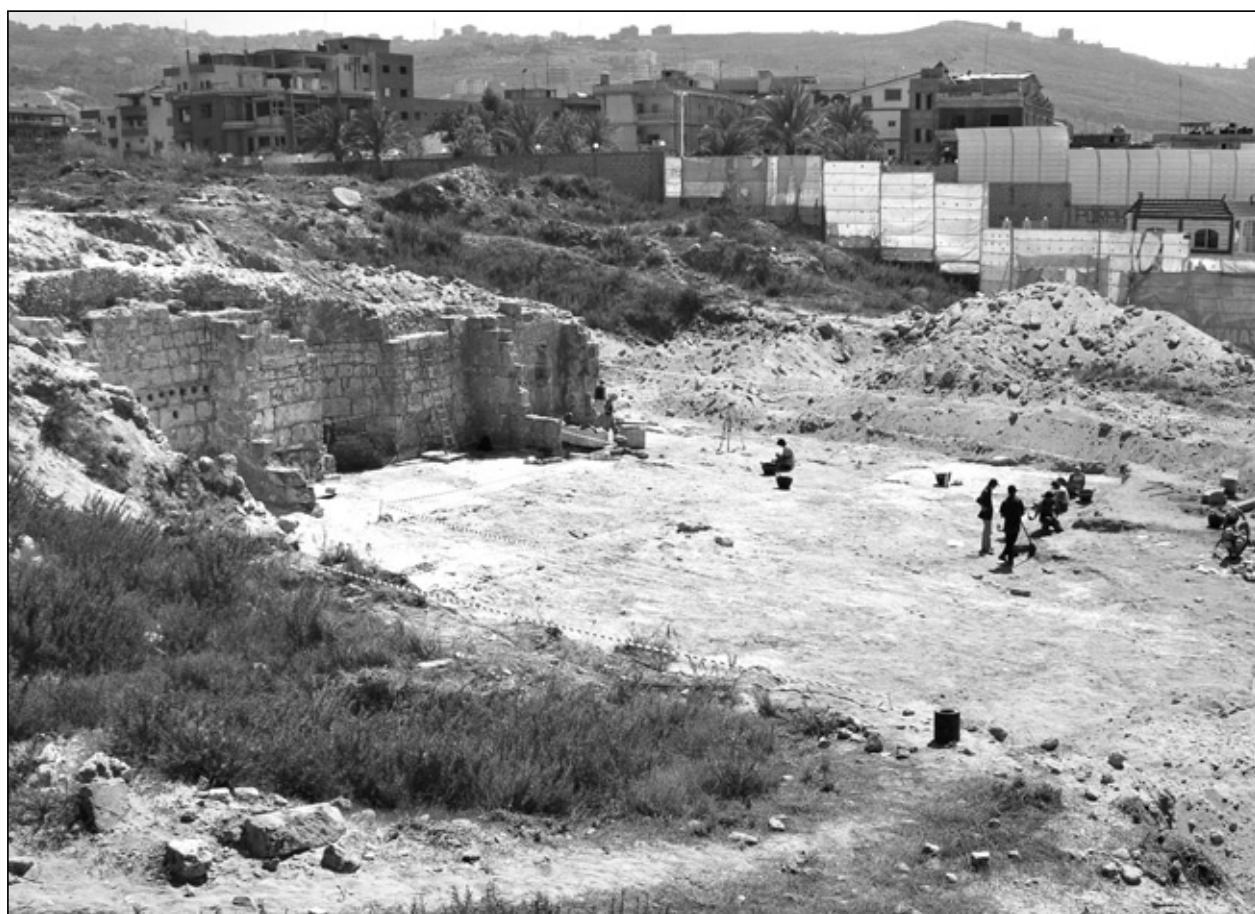
Fig. 1. Basilica Q in the course of excavation in 2005. View from the north. On the left, east wall of the church and beyond it, zone of the Late Antique settlement

The east wall of the basilica upon clearing proved to be no more than c. 0.50 m thick. It must have adjoined a thicker wall, the top of which survives as a smooth surface inclined eastward, suggestive of the spring of a vault. It could have been a big