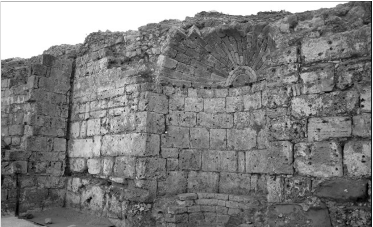
Fig. 2. East wall of the presbytery with the apse