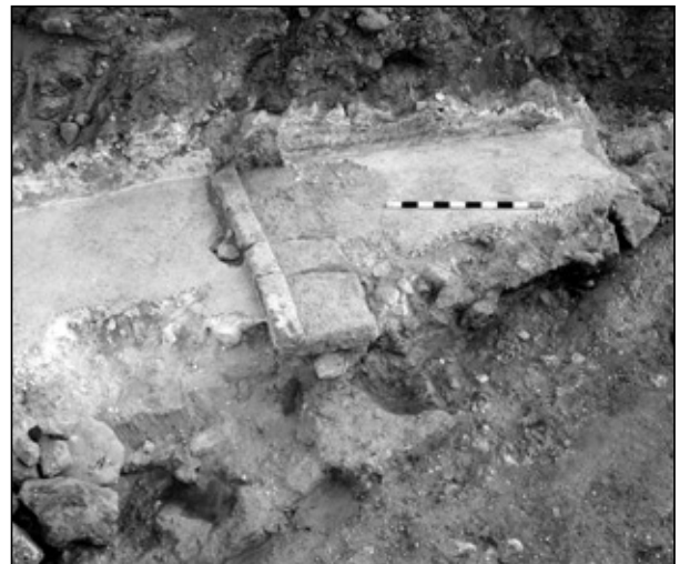
Fig. 5. Traces of floor and threshold dividing the northern aisle

The only trace of the original floor in the northern aisle was preserved by the north wall, about 9 m west of the east wall, where