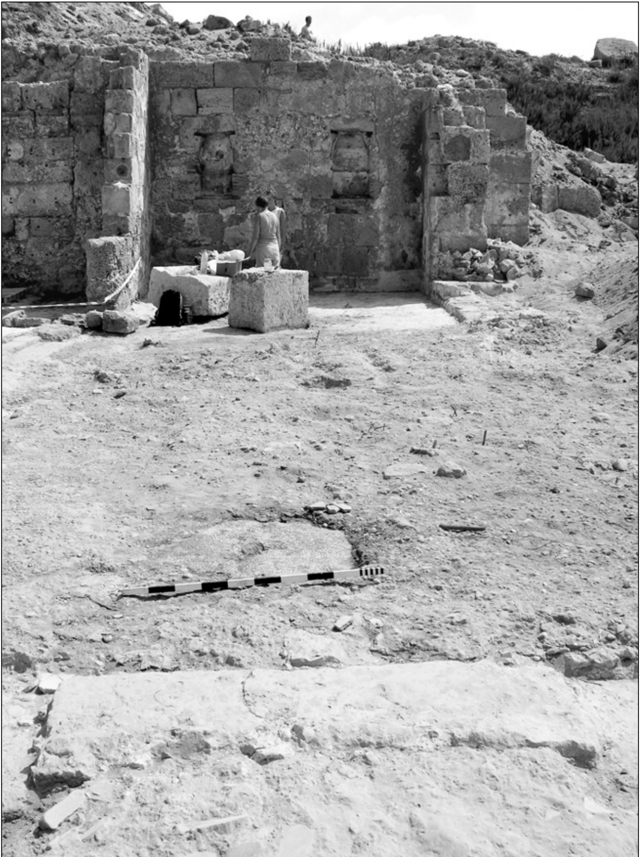
Fig. 8. View of the southern aisle from the west. Fragment of an apsed structure in the foreground with remnants of a geometric mosaic floor beyond it