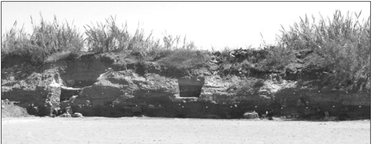
Fig. 10. Part of the stratigraphic section through the central part of the site. View from the west

Eight features were recorded, but only one identified as an apparent bread oven (Arabic tannur ). The remaining features, mostly sections of walls of local sandstone blocks coated with lime plaster, were too fragmentary for interpretation.