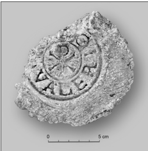
Fig. 4. Amphora stopper of lime mortar

J. Clédat (1913: 79-85) Other relatively rich private residences must have stood here, blending well into the ancient urban layout which can still be occasionally discerned on the ground surface, especially east of the mosaic trench.