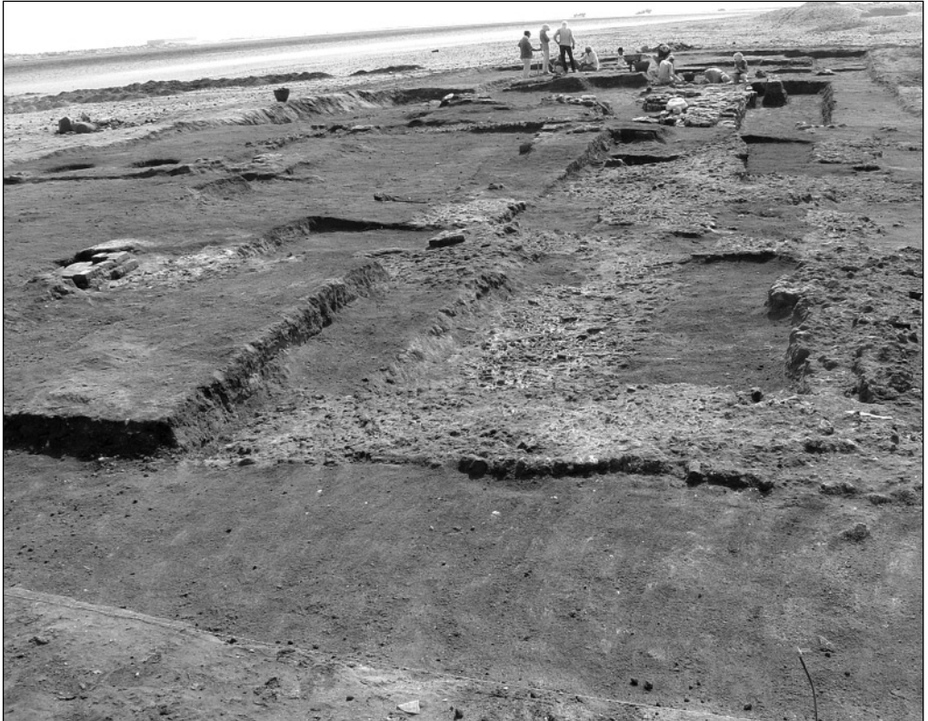
Fig. 2. Plan of the architectural remains uncovered in Sector 2

Extension of the sector to the west was aimed at tracing the architectural plan of the house with the mosaic floor. Unfortunately, the remains proved to be severely damaged by later digging and