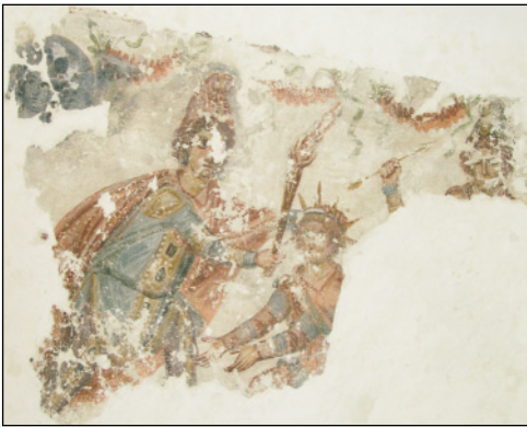
Fig. 2. Transfer of the Mithra scene from layer 1, now a separate panel on exhibition