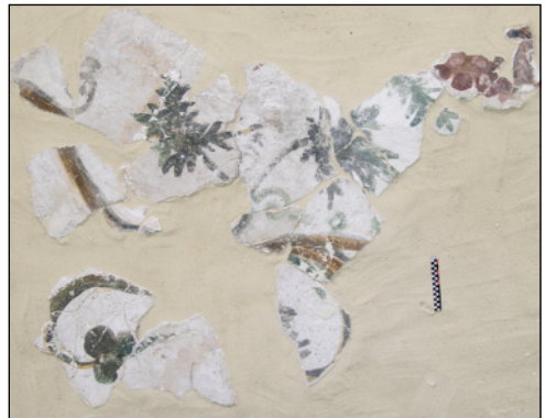
Fig. 5. Assembled fragments with grapevine and inscription from the ceiling from layer 2 (left) and from underlying layer 1, painted in different style