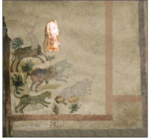
Fig. 1. Example of digital reconstruction work: Fragment of hunting scene from the southwestern corner of Room A in the Mithraeum (left) and proposed digital reconstruction