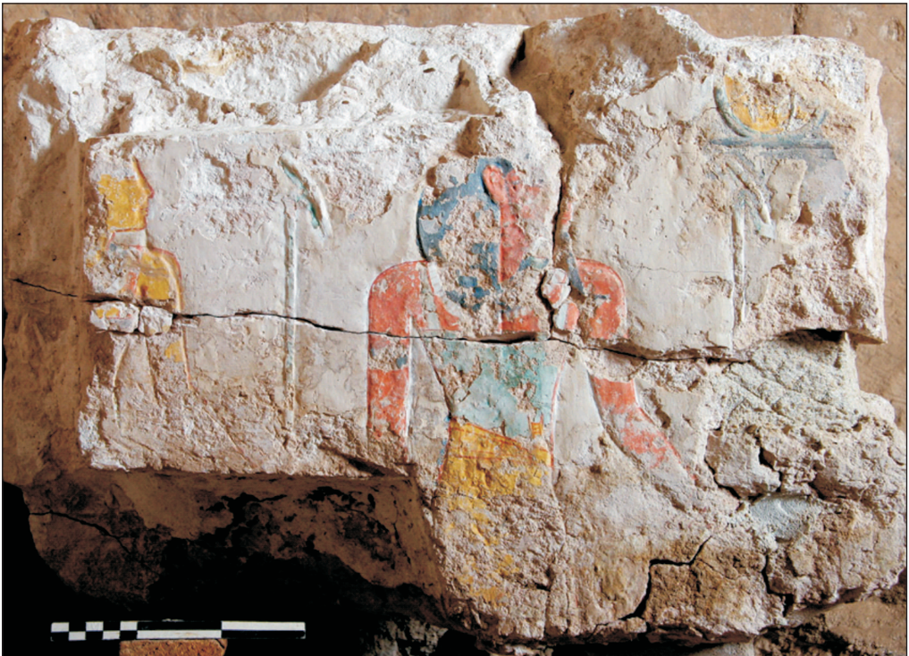
Fig. 2. New block (B.370) from trench S1/06 (2005/2006 season)