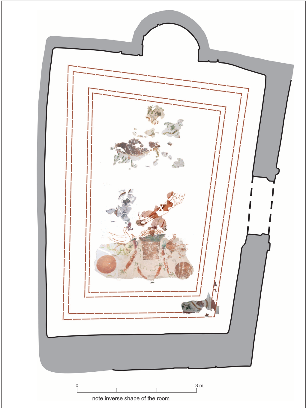
Fig. 5. Possible arrangement of the ceiling composition (Interpretation and processing D. Zielińska)