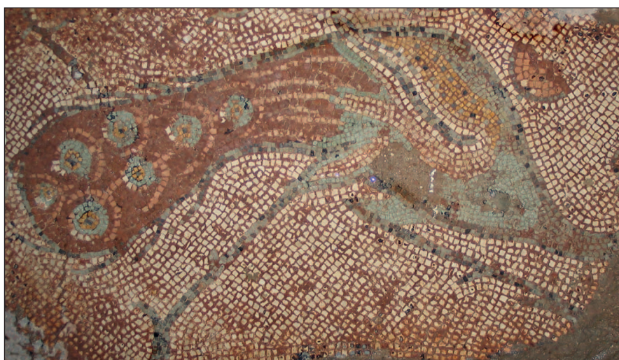
Fig. 4. Reconstructed peacock motif and parallel from a mosaic from Apamea (Museum in Qalat el-Mudiy)