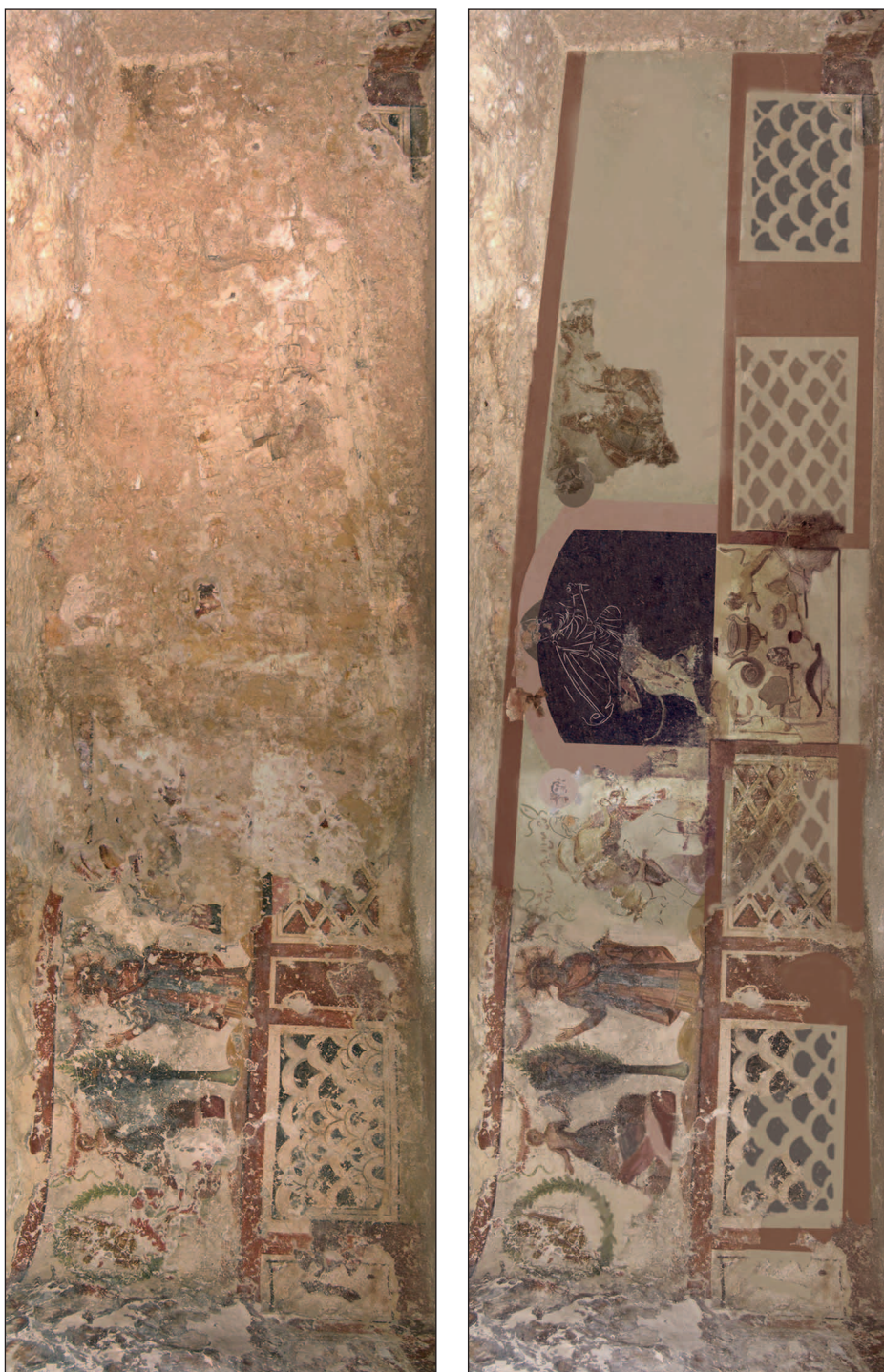
Fig. 3. The east wall of Room A, present view (top) and reconstruction of the painted decoration (Photo C. Calafornia-Rzepka; processing D. Zielinska)