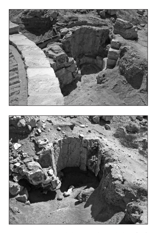
Fig. 2. Baptismal font, condition before (top) and after stabilization and conservation

Less than half of the baptismal font has survived over the ages, including fragments of the steps and south half of the basin [ Fig. 2 , top] erected of limestone blocks and red baked brick. The undermined structure, missing floor and footing, was in danger of collapse. The east and west steps of the font were lined with waterproof plaster ( opus signinum ), and the basin was lined with a white limestone mortar bed featuring imprints of the finishing tiles (the latter not preserved). All the coatings were severely deteriorated, cracked and displaced and in