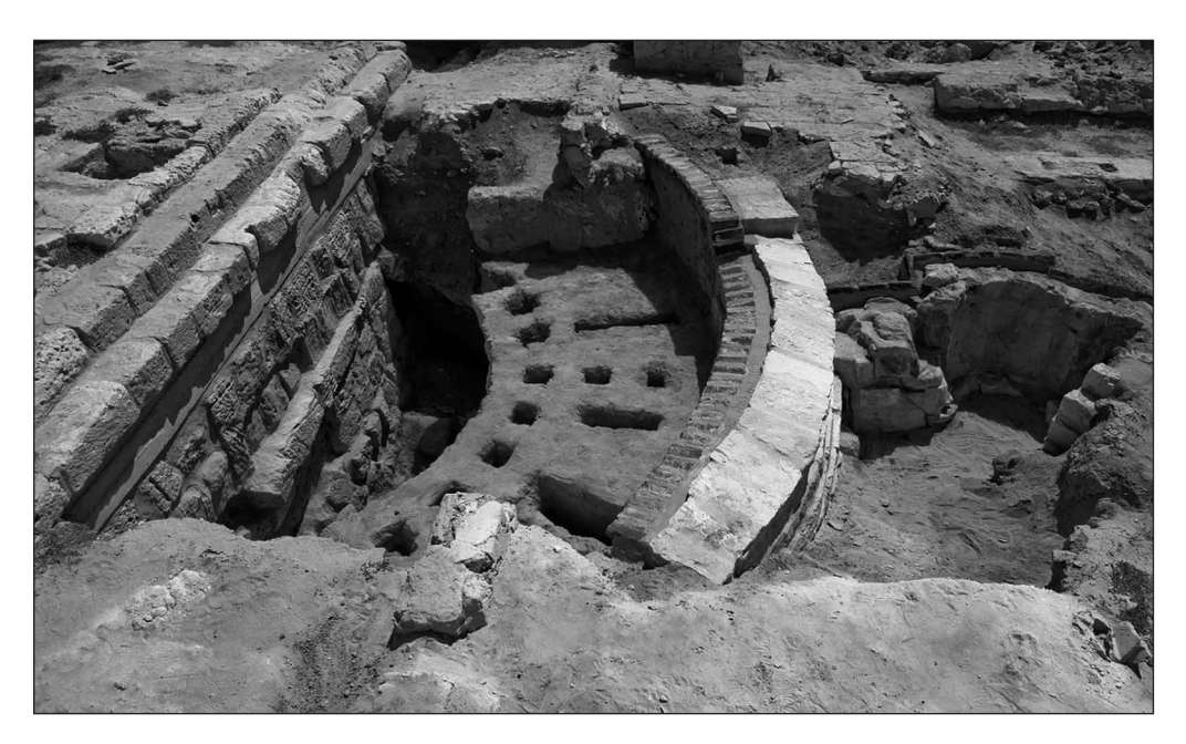
Fig. 1. Basilica presbytery area, general view, condition after the season in 2007. Note pottery kiln wall and baptistery font

masonry structures located within the presbytery area of the basilica, namely, the baptismal font and the earlier structure of the pottery kiln [ Fig. 1 ].