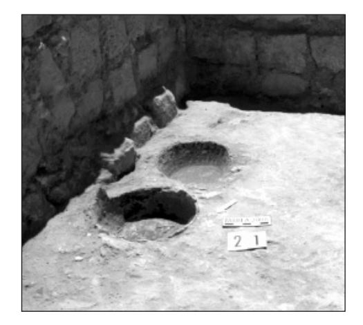
Fig. 1. Close-up of storage jars sunk in the floor in room 21

Finds from layers inside the basilica included numerous fragments of LRA 1 amphorae (Kellia 164) dated to the