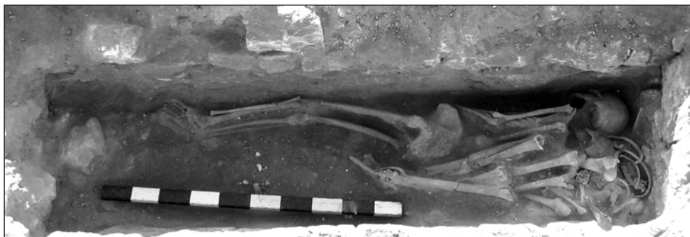
Fig. 3. Exploration of grave CW 35 of the Upper Necropolis: six burials but only one skeleton with the bones in anatomical arrangement

In view of the demonstrative character of this presentation, the collected data have been discussed summarily. Conclusions should be considered as preliminary, working theories to be verified in the course of further analyses.