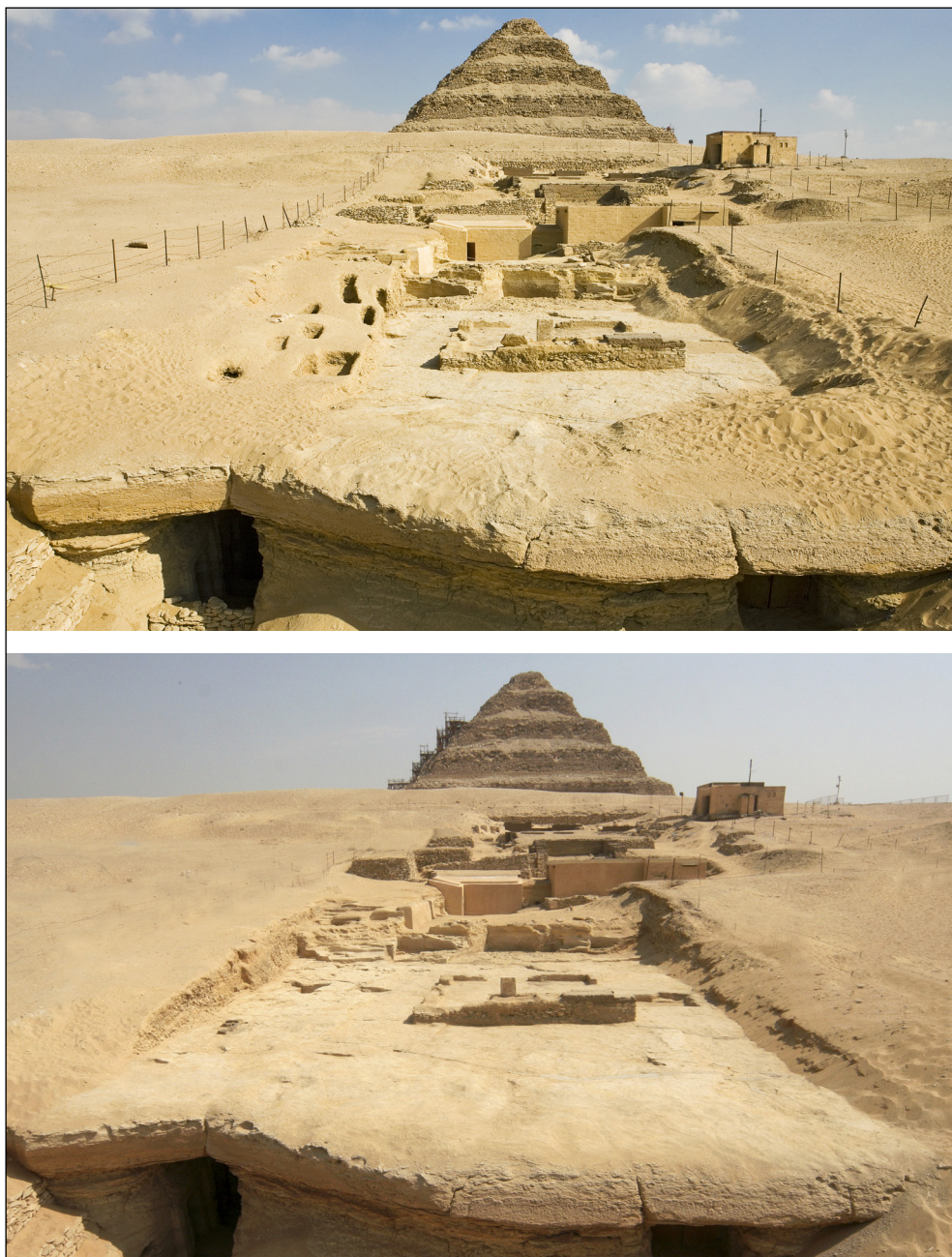
Fig. 2. View of the excavated area from the west at the beginning (top) and the end of fieldwork in 2010