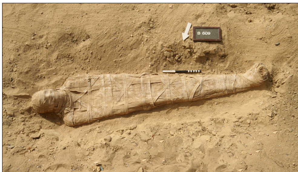
Fig. 4. Burial 609 from the Ptolemaic period in the Upper Necropolis

colored mud bricks, stone chips, blocks with painted marks, and dakka with a great deal of potsherds, proved that the quarry was used in the times of the Third Dynasty, most probably as a source of stone for the pyramid of Djoser or its gigantic enclosure wall. A sequence of irregular steps hewn in the rock and leading eastwards to the next platform, located approximately a meter higher up, must be interpreted as a track used by stonecutters for transporting blocks to the pyramid. Parts of the rock surface on both the lower and the upper platforms were overlaid with dark mud or a brick layer, proving that some features of the quarry