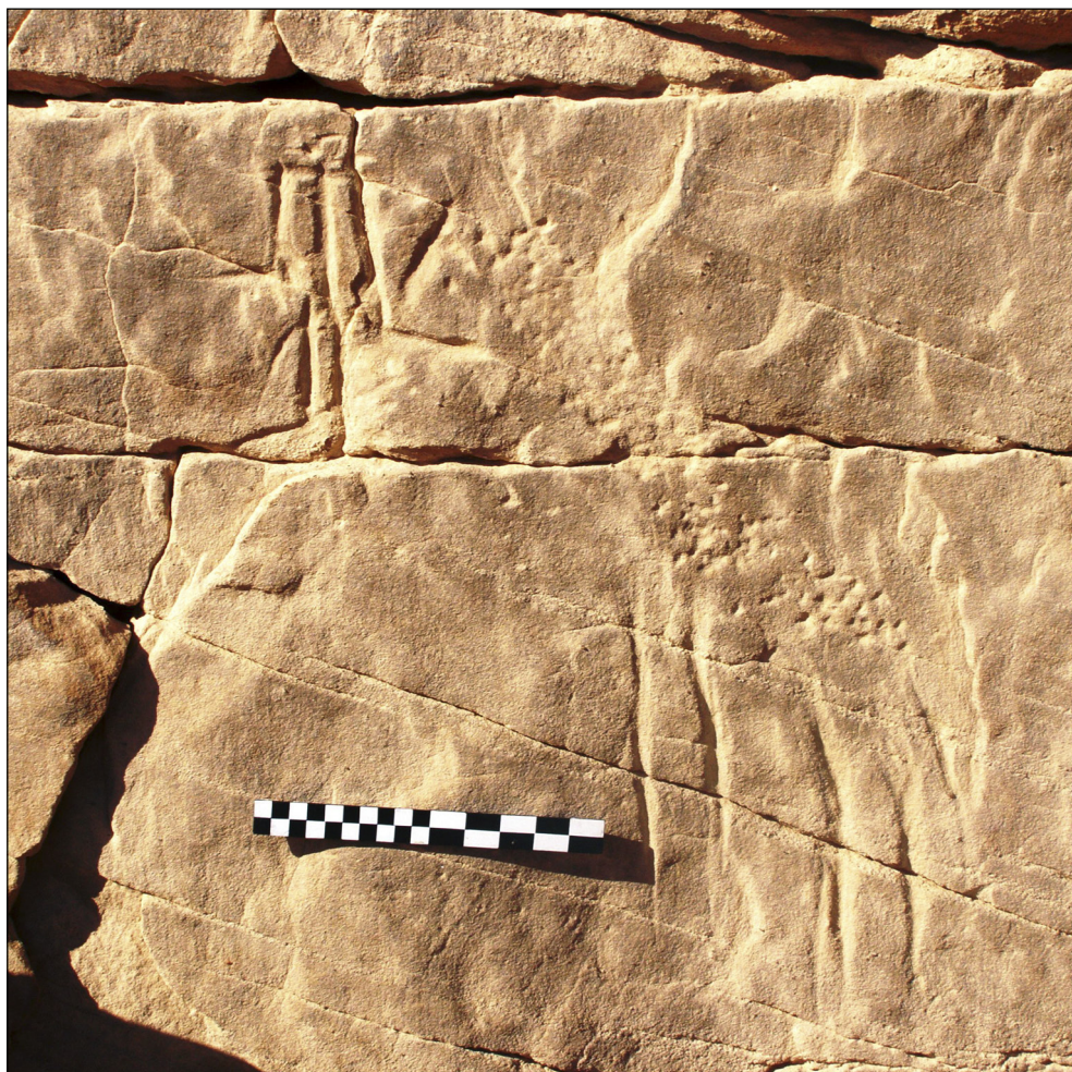
Fig. 3. Giraffe and anthropomorphic figure on the northeast wall of bill 6/09

whole. Foot and sandal images, of which there is more than 30 examples, are the commonest type. All were engraved on horizontal surfaces, sometimes in clusters, but more often as single images, never however as a pair (left and right shoe/foot executed in the same style). The foot/sandal motif is well known from the Eastern Sahara and the Mediterranean