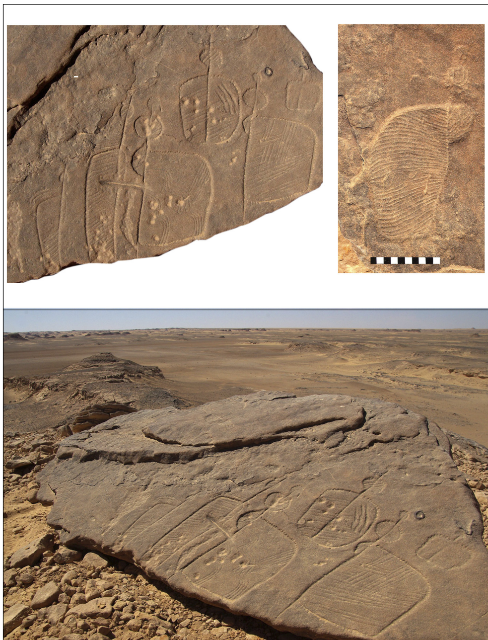
Fig. 7. Block at the top of Winkler's site 62; top left, close-up view of a group of six anthropomorphic figures; top right, individual 'female' figure