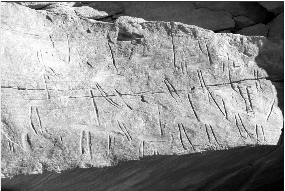
Fig. 2. Panel with ostrich depictions on site 6/09 (contrast enhanced)

Some figures potentially belonging to the Neolithic horizon can be seen also higher up on the cliff. The morphology