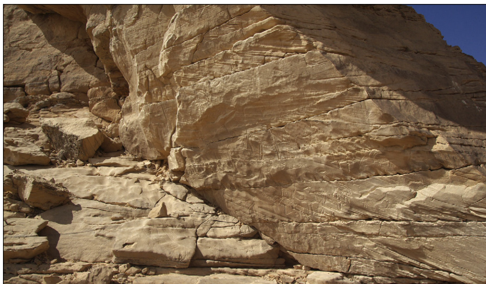
Fig. 8. Vertical panel covered with petroglyphs at Winkler's site 62

Another cluster of rock art appears on a vertical wall facing east, located on the northeastern side of the hill under discussion [Fig. 8]. It is a solid surface measuring about 5 m by 4 m and covered with dozens of petroglyphs, mostly of animals, appearing singly as well as in micro-scenes, consisting primarily of rows of specimens proceeding in one