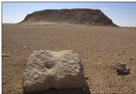
Fig. 12. Tethering stone in the vicinity of the site

A detailed documentation of Winkler's site 62 is only the beginning of a bigger project for the full recording of sites that the German scholar reported in a preliminary publication (Winkler 1939). Sites 66 and 67 have already been relocated, but their actual ranges will be determined in a forthcoming season. Site 66 is a single hill, but site 67 appears to be a conglomerate of many hills, which are yet to be identified.