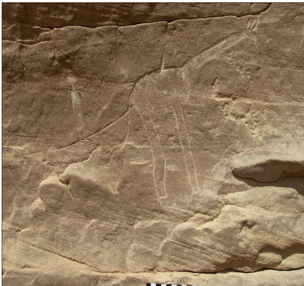
Fig. 9. Giraffe and anthropomorphic figure connected by a line

Two of the scenes merit special note. A giraffe is depicted in one case, executed in sunken relief with unusual, geometrically stylized legs. An arched line cuts across the back of its body, carved most probably earlier than the giraffe.