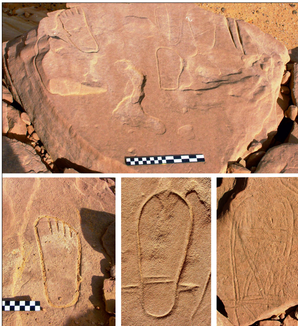
Fig. 4. Foot and sandal depictions from site 6/09: top, panel with foot and sandals in outline executed in different styles; bottom left, foot representation; bottom center, sandal with heel and straps depicted; bottom right, sandal with straps inside

art remains a matter of debate (Verner 1973: 13–56). Červíček dated some of the sandal petroglyphs to Horizon C (2100–1400 BC), but most of them to Horizon E (1050 BC–AD 250, Červíček 1986).