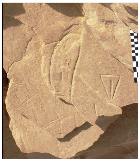
Fig. 5. Two sandals and a pubic triangle in juxtosition from site 6/09

Another recorded motif, although not as numerous, is the so-called pubic