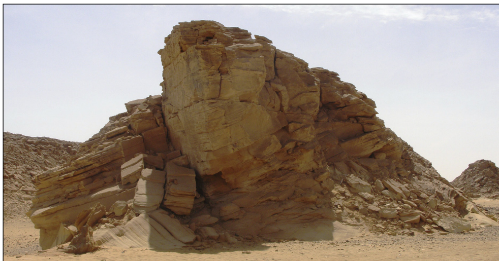
Fig. 1. Site 6/09, view from the north

Middle/Late Neolithic or Old Kingdom. 1 They occupy long smooth panels facing northwest, relatively high up on the steep northern cliff, making them impossible to trace. A combined technique was employed in their execution, the bodies of the ostriches being abraded to resemble sunken relief, the legs and necks of figures