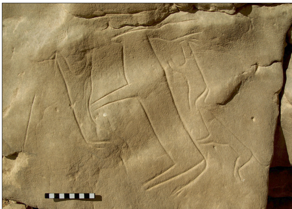
Fig. 11. Bovid chased by dogs