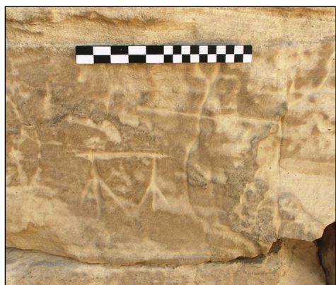
Fig. 6. Tribal mark(?) located high on the north-east side of the cliff on site 6/09

The younger time horizons are represented by relatively large numbers of geometric motifs (squares, rectangles, different configurations of lines). Their