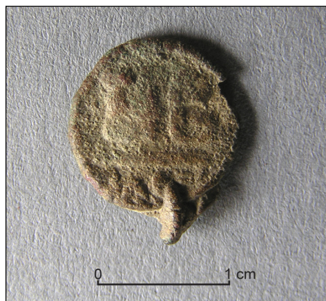
Fig. 1. 12-nummia coin, probably of the Emperor Maurice

Found in the topsoil was the sole monetary find to date south of the Third Nile Cataract, a cast copper 12-nummia coin, identified by the author as struck probably by the Emperor Maurice [Fig. 1]. 1