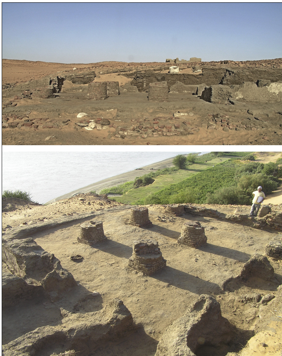
Fig. 3. General view of Building B.VI from the west, top, and view of colonnaded hall B.VI.1 in the central part, view from the southeast