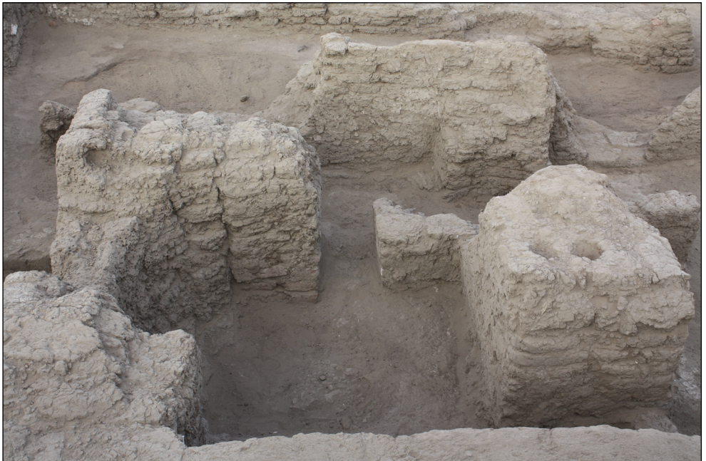
Fig. 8. Unit B.VI.11, view from the east