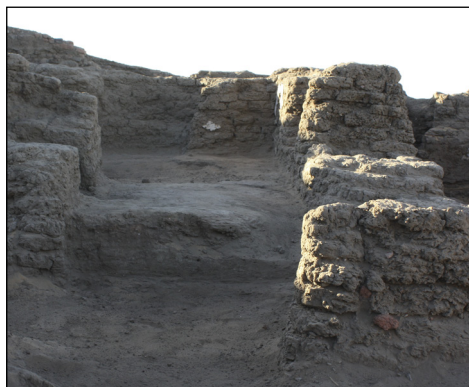
Fig. 4. Secondary passage from room B.VI.4 to B.VI.1, view from the north

passage leading to B.VI.1 was a secondary cut, approximately 0.70 m wide, in the north wall. It had a wooden door with a pivot on the west side [Fig. 4]. Located east of B.VI.4, room B.VI.5 was almost identical in size and also had a secondary entrance, as well as an original passage to