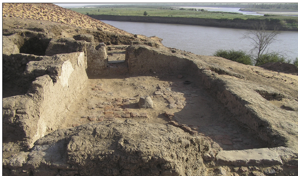
Fig. 5. Room B.VI.2, view from the north