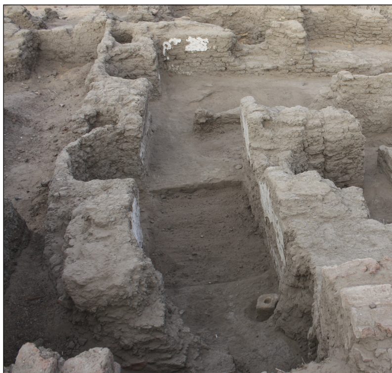
Fig. 9. Unit B.VI.12, view from the east

West of the central part of Building B.VI (B.VI.1, 2) was a row of rooms similar to those on the eastern flank. These units were of various width, from 1.80 m (B.VI.20) to 2.50 m (B.VI.17). Unlike the rooms on the eastern side, all of these units were plastered and whitewashed, although in this case it was only one coat, not six as in B.VI.2. Communication between this set of rooms and other parts of the building