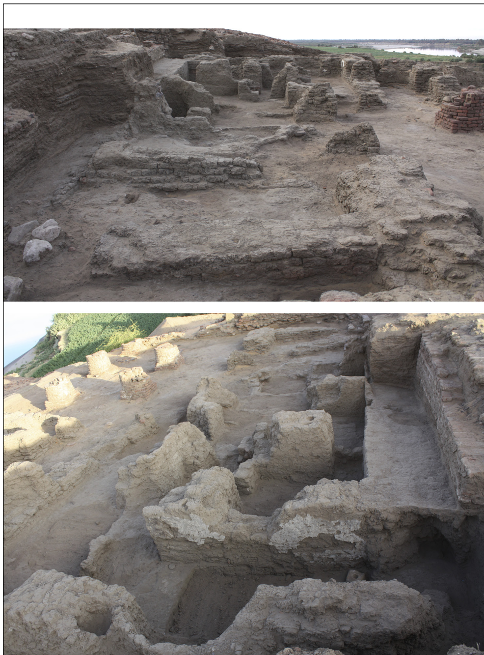
Fig. 6. Eastern flank of Building B.VI: top, view from the north; bottom, view from the south