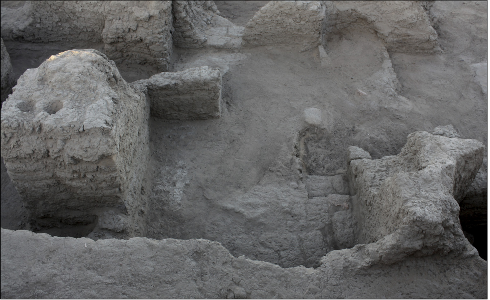
Fig. 7. Unit B.VI.10, view from the east