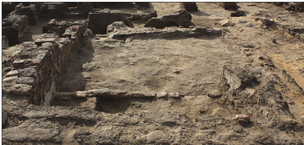
Fig. 10. Funj-period house C01.H08, view from the west during excavations, view from the east

The house [Fig. 10] consisted of one room, 4.50 m by 3.46 m, where three occupational levels were distinguished. The entrance was located in the northeastern corner of the east wall. A partition wall, 1.66 m long and 0.49 m thick, ran south of the entrance. A bench extended along the east wall up to the southeastern corner. It was 2.53 m long with the southern part set off (approximately 0.65 m from the south wall). Its width was 1.38 m wide at the northern end, narrowing to 1.18 m at the southern end. In the southwestern