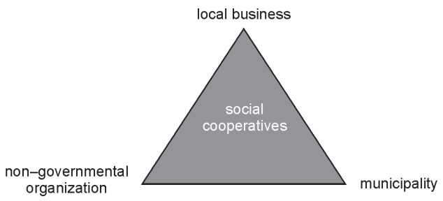
Fig. 1. The formula of the "triangle of public benefit"

The chance to counteract the exclusion of people with disabilities in a local area is the creation of social cooperatives according to the formula of the "triangle of public benefit."