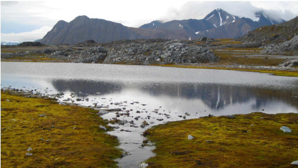
Figure 2. West Spitsbergen ice-free area