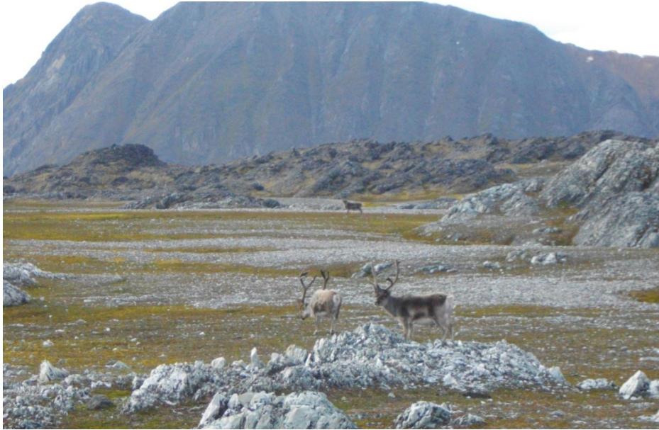
Figure 1. Reindeer grazing on sparse meadows of Western Spitsbergen

Source: Photo by D. Rozmus taken in 2016.