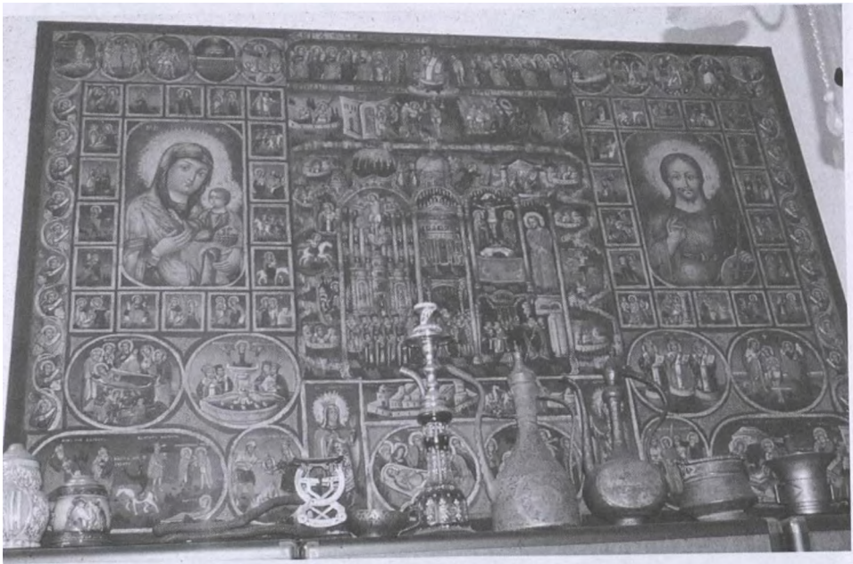
5. Proskynetarion; Sofia, Edmond Gallery (Bg 2).