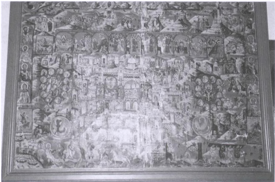
2. Proskynetarion; Island of Patmos, Monastery Zoodochos Pege (Gr 5).