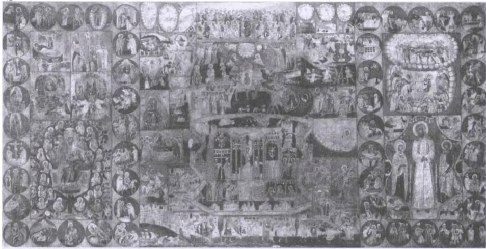
1. Proskynetarion; Warsaw, National Museum (Pl 1).