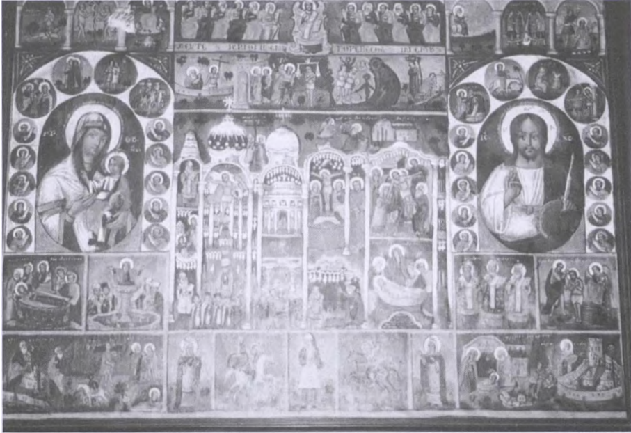
3. Proskynetarion; Island of Patmos, Monastery Zoodochos Pige (Gr 6).