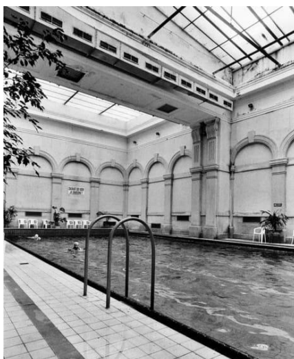
Image 3. The Grössling Swimming Pool in Slovakia