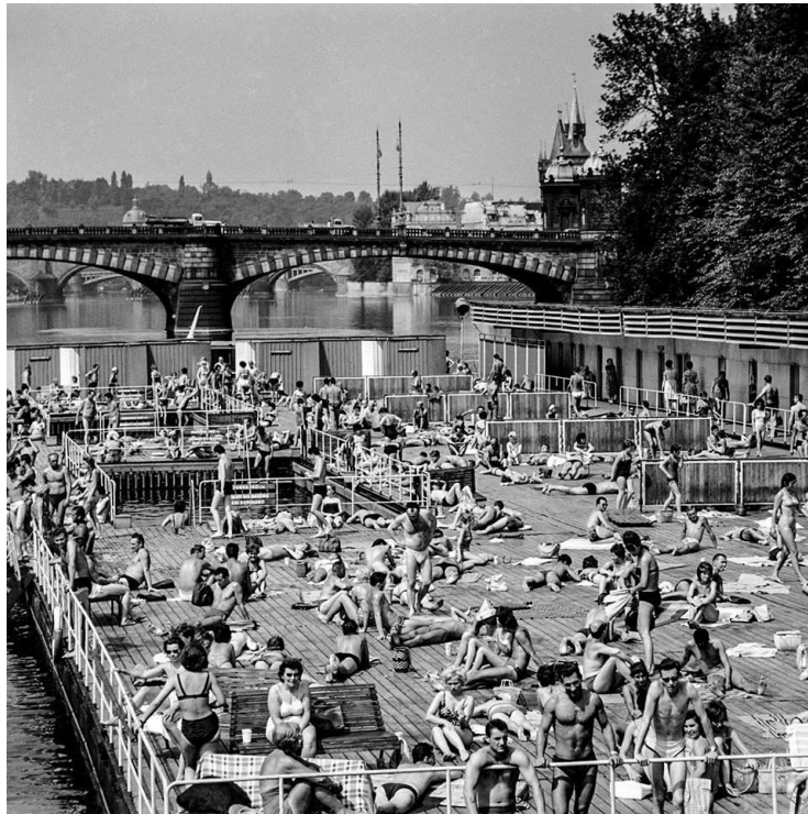
Image 1. The Slovanka swimming pool on the Vltava river

During the inter-war period, many natural, popular and often frequented swimming pools and river springs were established in Czechoslovakia. Among the most famous was the aforementioned swimming complex in Barrandov, Prague, opened in August 1930. There were also many riverside swimming pools in Prague, such as Žluté lázně in Prague's Podolí which was opened in 1910, the Na Mlýnka Spa, the Ponton Spa in Žofín and the Civic Swimming Pool in Klárov. A large number of natural swimming pools were also open to the public in the vicinity of Prague and other towns in Bohemia and Moravia.