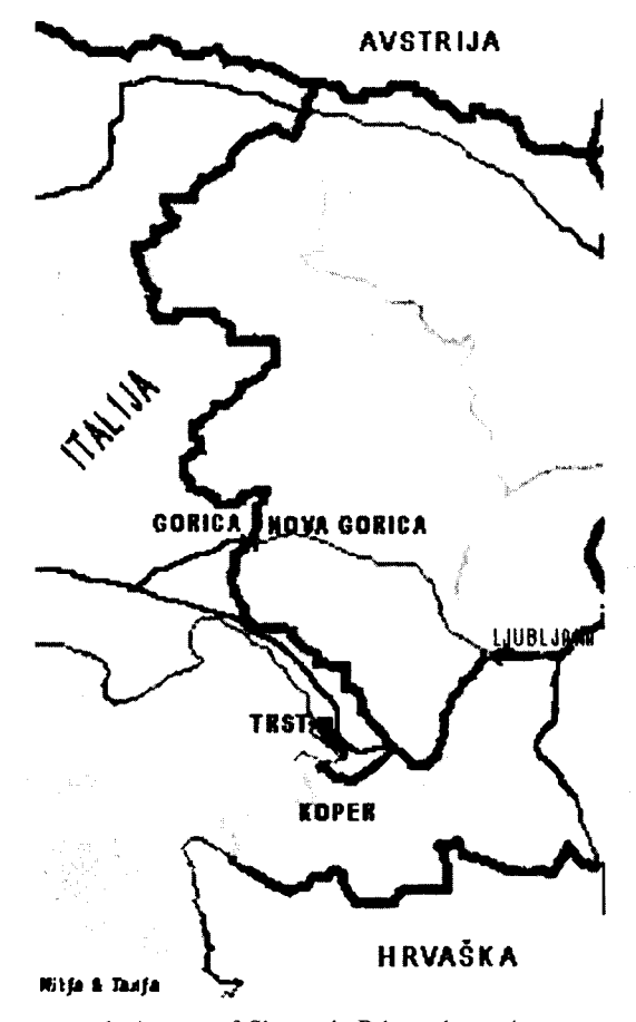
1. A map of Slovene's Primorska region

ated the possibilities that might for an undefined period of time stay hidden in more providentially run smaller communities."<sup>52</sup> A similar sentiment probably inspired the creation of Nova Gorica. And yet despite this utopia Nova Gorica represents a "collective memory accumulated in form"<sup>53</sup>. Torkar believes that it is "a phenomenon of centuries, a cultural, economic and national phenomenon that will always illustrate a certain degree of awareness (rationality) of a lifestyle that in every period of time builds a 'monument' to itself and to its descendants"<sup>54</sup>. The town of Nova Gorica, created in the 1950s, will always portray a story of separation and of renewed search for connections.