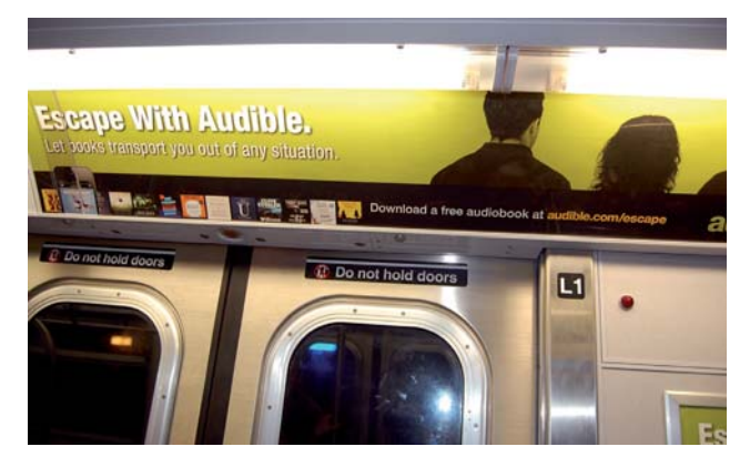
Figure 2. Audio books' ad in the NYC subway. Audiobook as a tool of "escaping" "from any situation" – isolation and being present at the same time

Digitalization, common access to the internet and finally, special applications (e.g. LMSN) for portable devices have caused the "presence" of the user to no longer be limited to the sound or visual channel. "To be" in a certain place means at the same time physical dwelling e.g. on