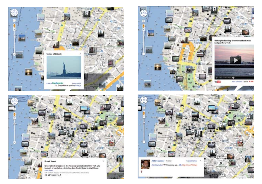
Figure 3. Lower Manhattan on Google Maps. Four different options of developing the map by: photo, video, Wikipedia, Buzz