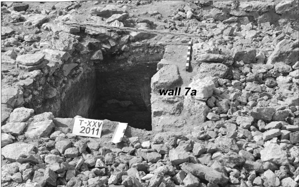
Fig. 4. Trial pit “Street b–N”, Wall 7a, view from the north.

Ryc. 4. Sondaż „ulica b–N”, mur 7a, widok od strony północnej.