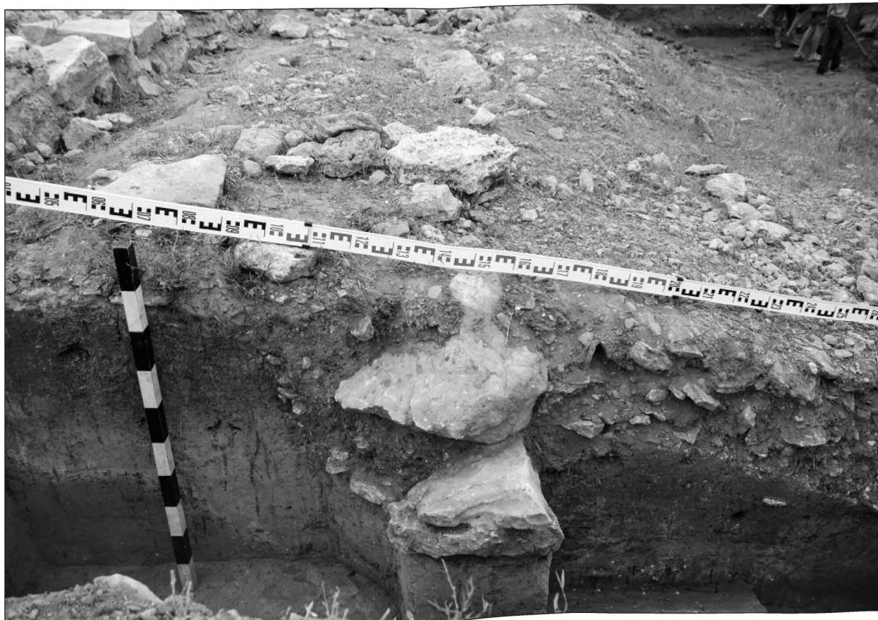
Fig. 3. Trial pit in entry road, foundation trench of the defensive wall, 2 nd c. BC, from N.

The ceramic mass assemblage was dominated by Hellenistic material, especially numerous fragments of Rhodian amphorae.