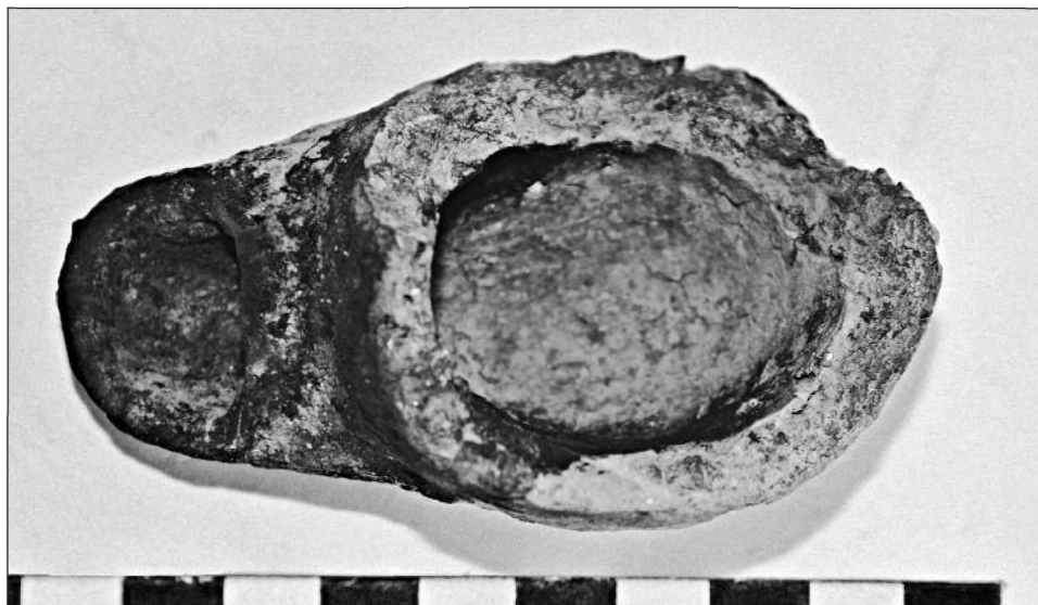
Fig. 5. Handmade lamp of clay.

Ryc. 5. Gliniana, ręcznie lepiąca lampka oliwna.