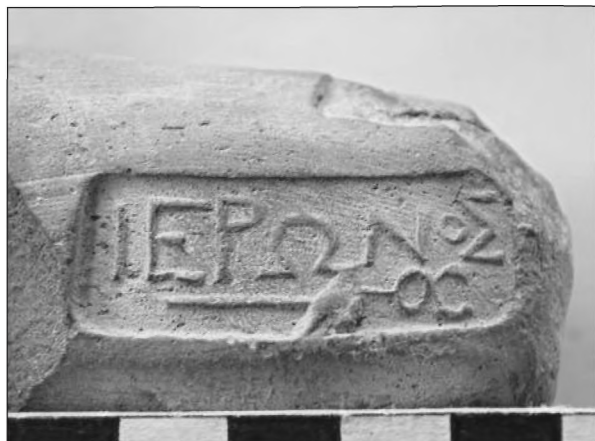
Fig. 3. Rhodian amphora stamp, middle of the 2 nd c. BC (Photo T. Scholl).

Ryc. 3. Odcisk stempla na amforze z Rodos, połowa II w. p.n.e.