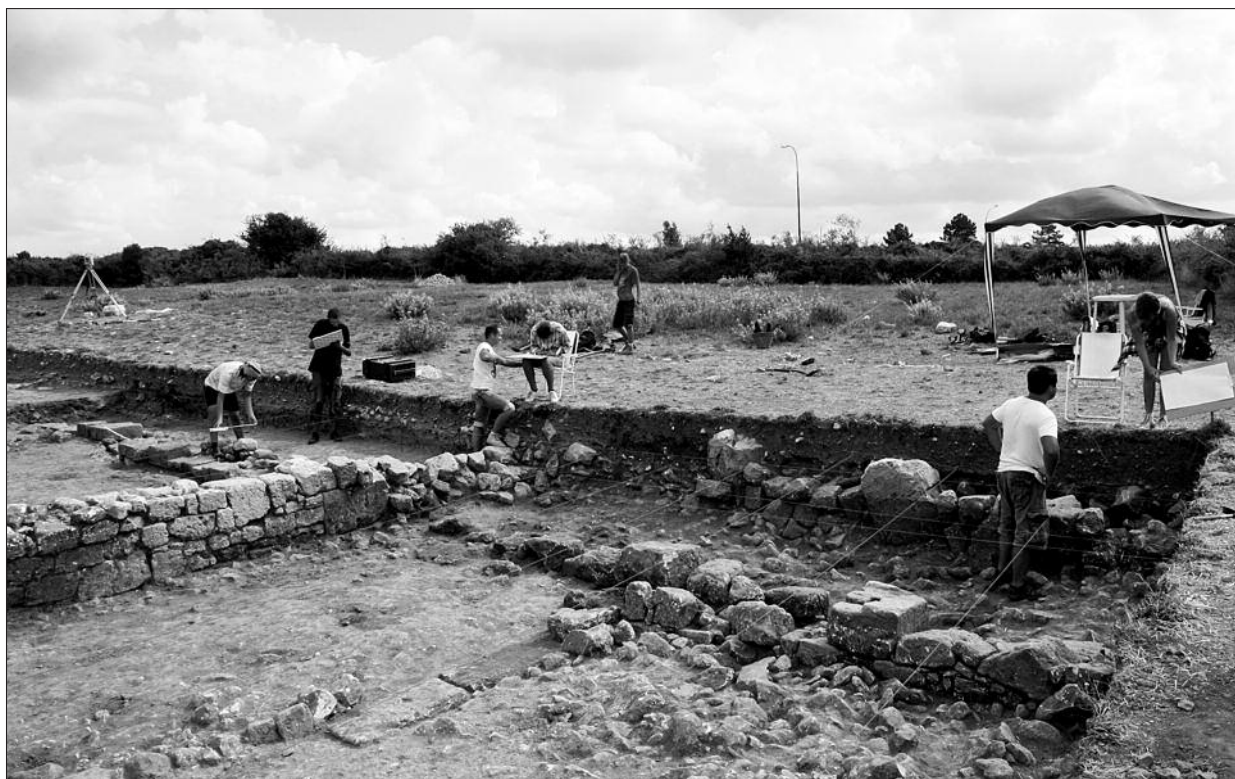
Fig. 1. Fieldwork in Trench I in 2012. Ryc. 1. Prace na wykopie nr I w 2012 roku.

(8.8%), South Gaulish terra sigillata (7.0%), black-glazed pottery (approx. 5.3%), jugs (24.6%), bowls (7.0%), lids (3.5%), louterion (1.75%), and amphorae of the Africana II Grande (1.75%) and of Late Antique (1.75%) types. 2