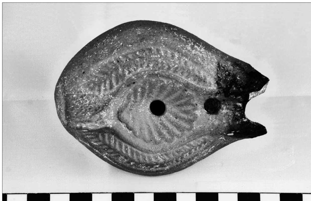
Fig. 3. Example of a typical Late Roman oil lamp imported from Roman North Africa. AK12/I/3-102 (Photo M. Miętek). Ryc. 3. Przykład typowej późnorzymskiej lampki importowanej z Północnej Afryki. AK12/I/3-102.