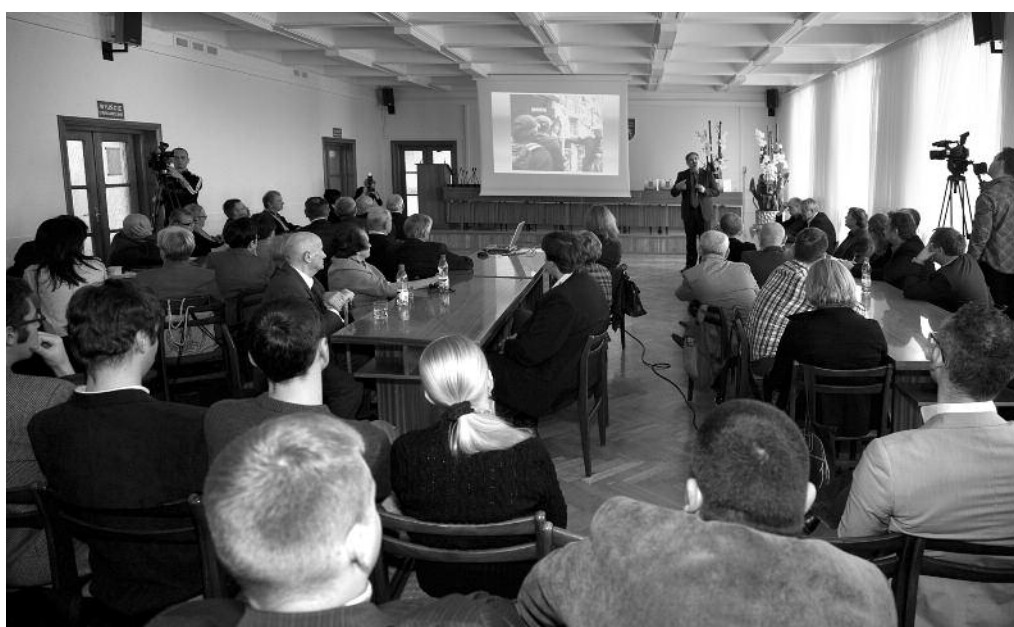
Fig. 2. Session in honour of Prof. Tomasz Mikocki.