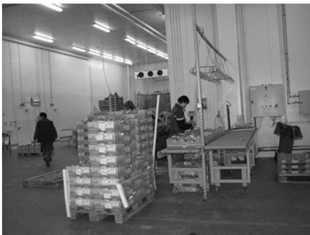
Figure 1. Refrigerated warehouse ANECCOOP POLSKA, Swarzędz (2011)

Moreover, many of domestic importers also provide transport-logistics services since they own their means of transport and storage facilities (refrigerated warehouses). The storage of fruit and vegetables also takes place at the importers' warehouses or other storage facilities offered by ports or wholesale companies.