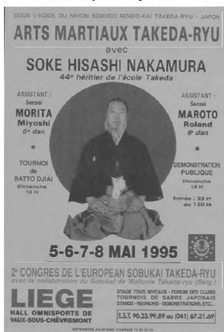
The last EST Congress in Liège (Belgium)