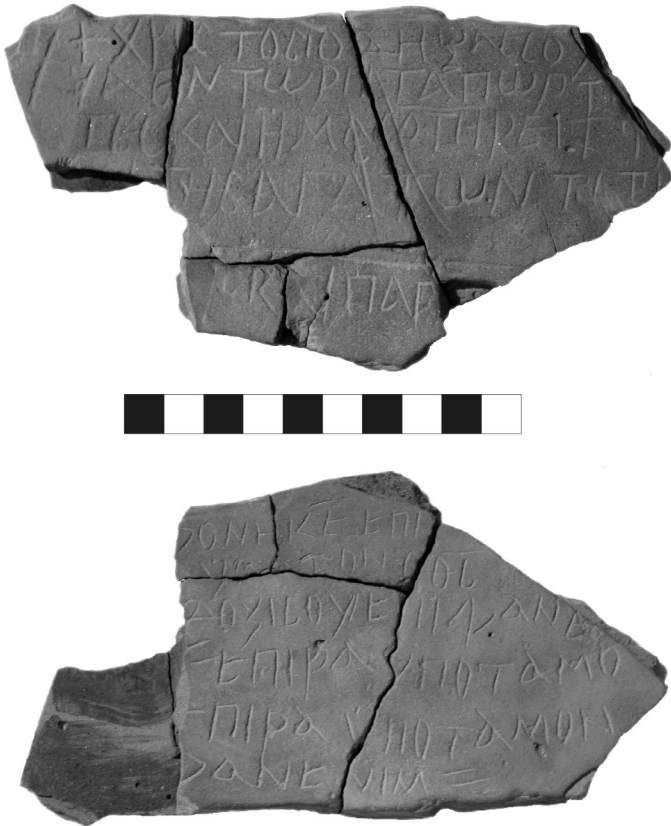
Fig. 3. SMN 23165: Foundation deposit (?) inscription on mud (text on both sides) from Akasha

The preserved fragment reads: P (horizontal line), Λ (corner), O (vertical line). At least another letter can be discerned under O .