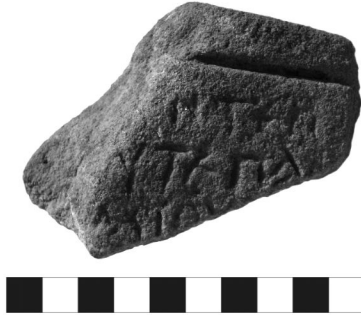
Fig. 2. SNM 18386: Fragment of sandstone tombstone from Semna, inscribed with a common Coptic text

16) SNM 18386 (fig. 2) is a more interesting fragment (11 x 9 x 3.5 cm), since it contains the first three lines of a recognizable prayer in Coptic: