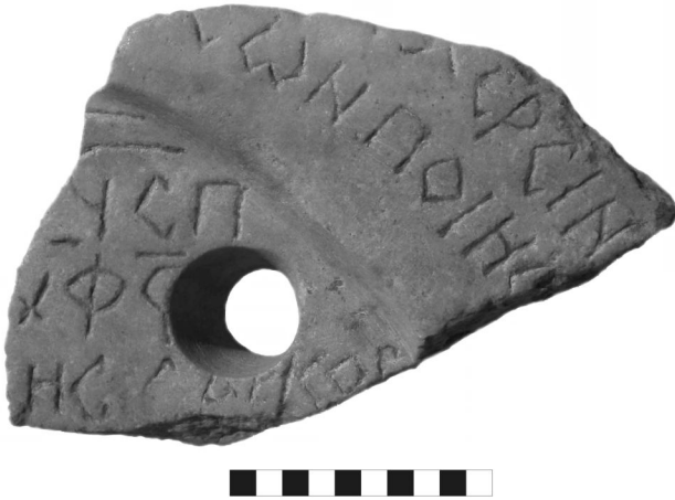
Fig. 5. SMN 32120: Fragment of a re-used inscribed round marble stela from Old Dongola

diameter). Fragments of two parts of what seems to be the same inscription are preserved. The first one occupies the raised border of the main epigraphic field in the center. On this border there must have been a text running in two lines. The preserved part reads: