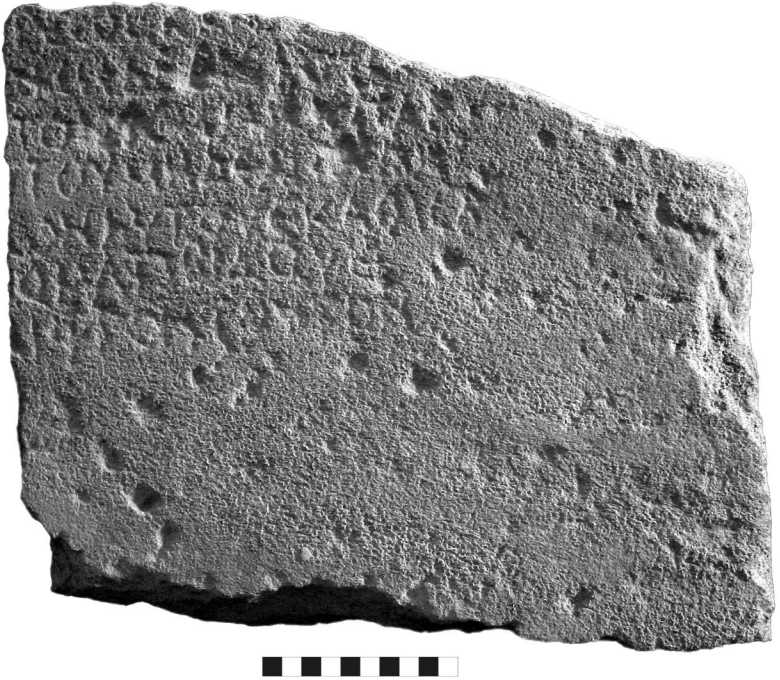
Fig. 1. SNM 24841: The 'retrieved' Ezana stela ( I. Khartoum Greek 78 )

(SNM 14451) and 83 (SNM 32115) have already been identified and/or given a new museum number.