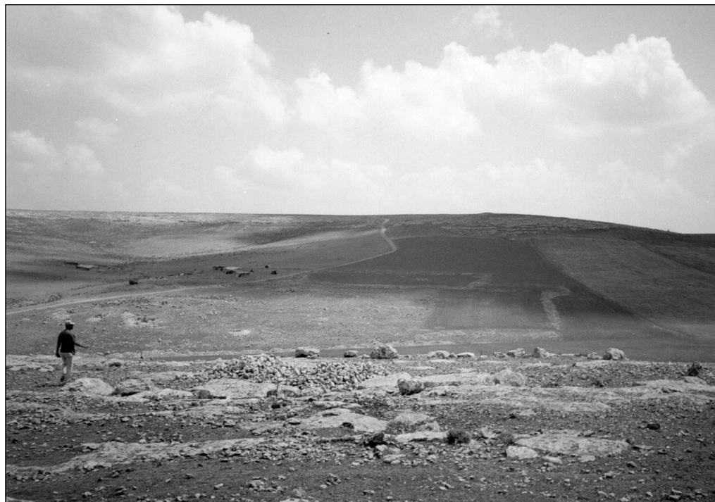
Fig. 1. Khirbet al Berge. Ruins in the valley viewed from the west

Robbers' pits, evidently newly cut, were observed in a number of places inside the buildings, damaging severely ancient occupational layers. (Some of these pits had been covered with stones after our first visit to the site, suggesting that the robbers are continuously active in the area.) The nearby cemetery, obviously connected with the site, also had incurred heavy damage, including apparent removal by bulldozer of layers of soil covering the tomb entrances.