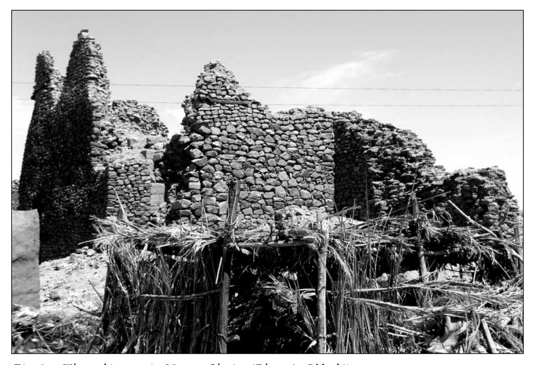
Fig. 3. The architecture in Merawe Sheriq