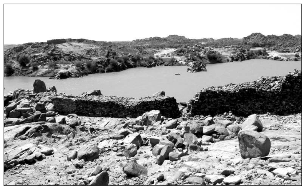
Fig. 2. The fortress at Swueqi