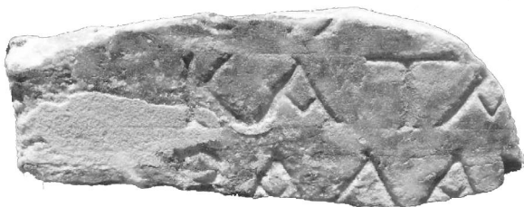
Inscription 3

original placement of the inscription could have been the southern portico of the agora where fragment (a) was discovered.