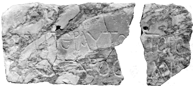
Inscription 2

composed of five smaller adhering pieces, is 33 cm wide, fragment (b) – 13 cm wide. The fragments are not congruent. A ca. 7 cm-wide portion of the plaque extending through its whole height is lacking, which means that the complete width of the plaque was equal to ca. 50 cm. The plaque was 22 cm high and 1.4–1.7 cm thick. Two holes for nailing the plaque are visible at 3/4 of its height. The inscription occupies the space under the holes. It was carved without guidelines, not very carefully. The executor of the inscription poorly spaced out the text within the area to his disposal and was forced to tighten the letters near the right-hand edge in both lines. The height of letters varies from 4.4 cm ( omikron in Kαίσαρος ) to 5.8 cm ( iota in Kαίσαρος ). Paleographically the letters represent round epigraphic majuscules. Alpha ‘à barres brisées’, apices .