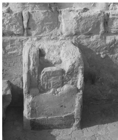
Inscription 1 in situ

Due to the fragmentary state of preservation of the inscription its character is unknown. It most probably was an honorific inscription accompanying the erection of a statue, but other possibilities, such as a religious dedication, also come into question. What has been preserved from the inscription is the dating formula.