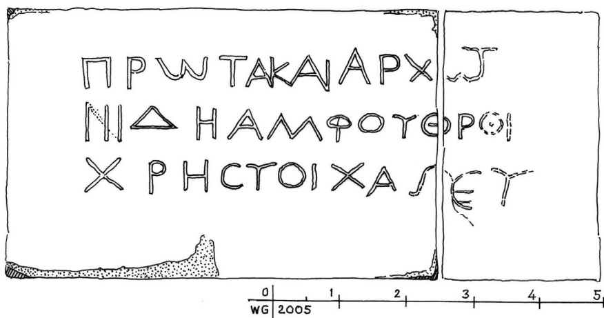
Inscription 4 (photo and drawing by Stanisław MEDEKSZA)