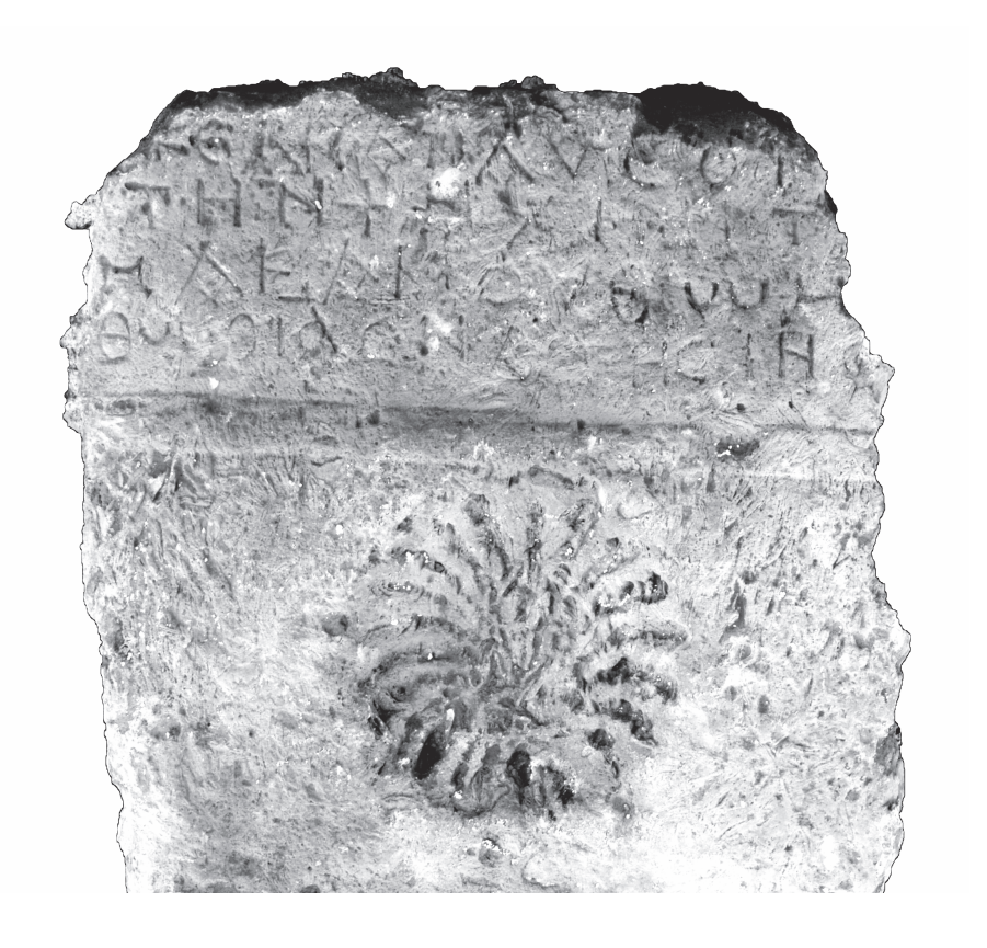
Naqlun. Grave stela of Thomas (Nd 09.592).