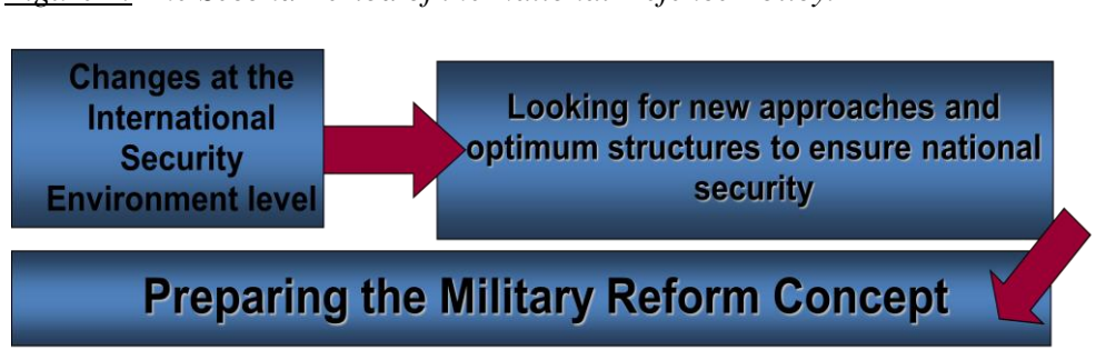
Figure 1. The Second Period of the National Defence Policy.