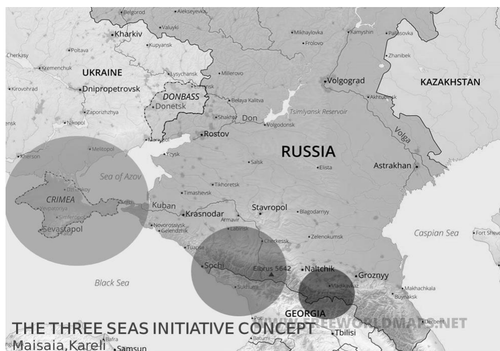
Map 1: The 'Three Seas Initiative' concept.

After the war between Russia and Georgia in 2008, the 7th Abkhazian military base was formed in the town of Gudauta, as a result of the reform of the 58th Army and 131st Brigade. In addition, the military bases of the Southern Military District are located in Transcaucasia – on the Occupied Territories of Georgia – 4 th base Tskhinvali region – in Tskhinvali and Java. The military units and units of the Southern Military District are located in three administrative units of the Russian Federation – the South, the North Caucasus and on the annexed territory of Ukrainian Crimea – since 2014.