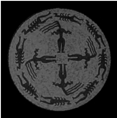
Figure 1. Samarra vase 1

cal, linear eye [Figure 3]. In contrast, the earlier art produced in the sixth to fifth millennium sites (i.e., prior to the introduction of the impressed script-based tables) is highly stylized, with compositions covering the entire circumference of the vessels, and whose effect is delivered as a whole, mainly due to repetitious designs, and usually presented in circular or topsy-turvy patterns, and with no narrative composition [Figures 1 and 2].