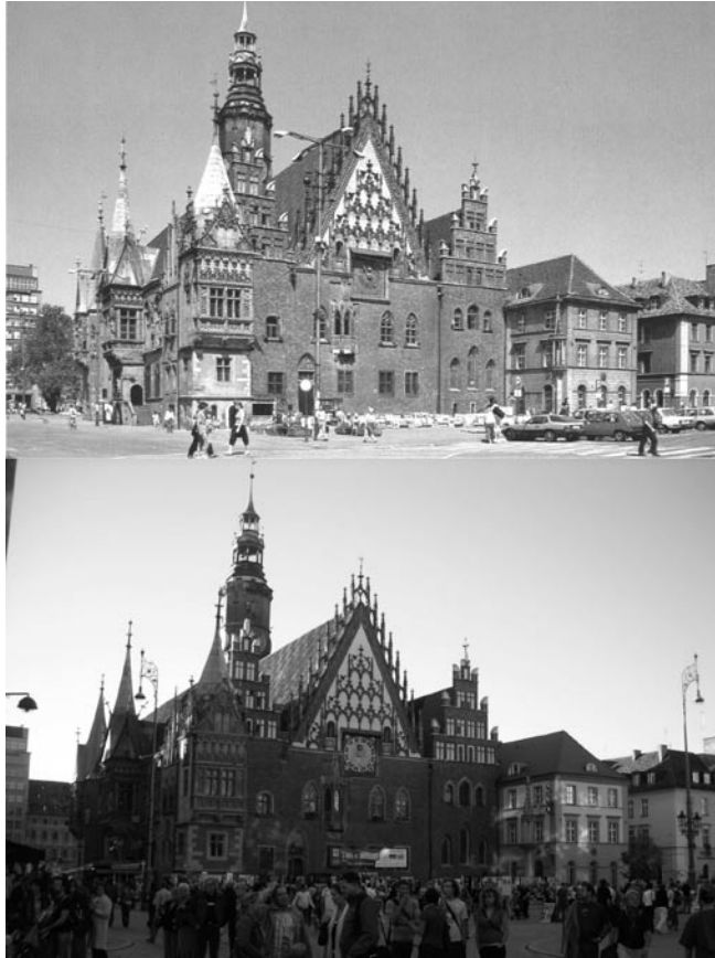
Fig. 3. Rynek (Market Square) in Wrocław in 1997 and 2007. The most characteristic, high-quality public space in the city

While understanding the complex perception of Park Szczytnicki we may easily interpret the change in the level of approval of Rynek and Ratusz. This area, like Ulica Świdnicka described above, has been completely renovated (Fig. 3). Not only has the surface been replaced but also old, historical buildings have been restored. This overall improvement of the landscape is probably the reason for the success of this area in the opinion polls in 2007.