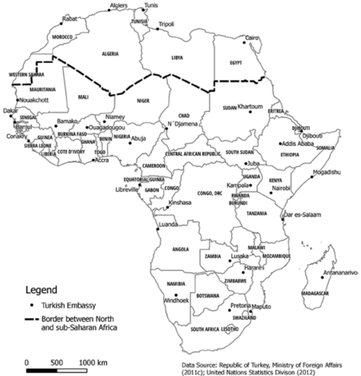
Fig. 2. Demarcation between North and Sub-Saharan Africa and the Turkish embassies in African countries