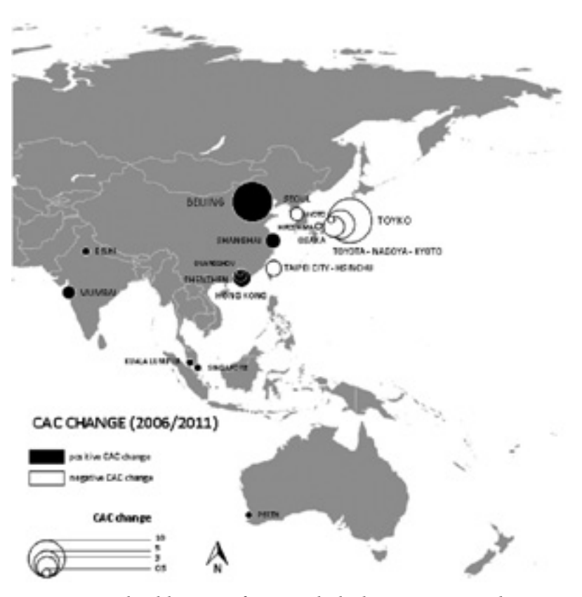
Fig. 1. Geographical location of cities with the largest positive and negative CAC change