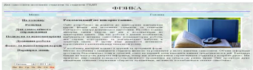
Pic. 1. The title page of our E-book

We developed an e-book which has a menu that contains: Home, calendar, schedule lessons, problems for testing one’s learning, video and podcasts, homework, photos and videos of our students (Pic. 1).