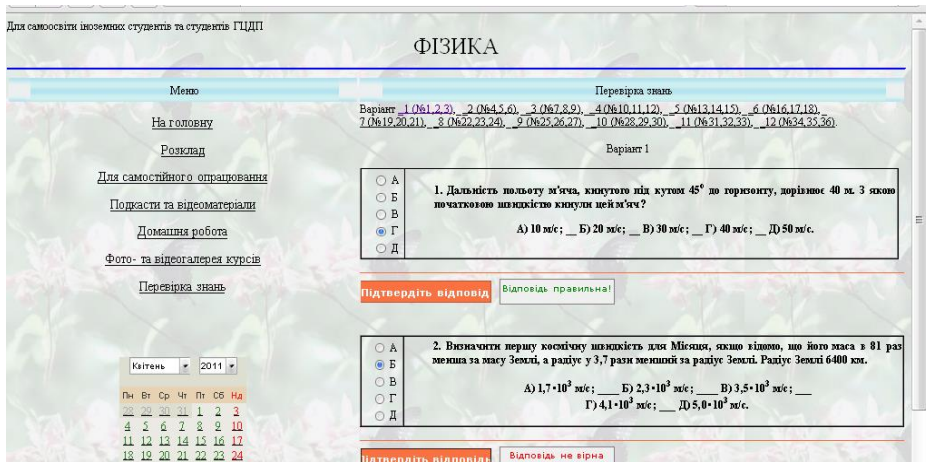
Pic. 6. The menu item „Testing”

Item „Testing” (Pic. 6) contained in the menu and allows using twelve different variants of computer tests for revealing the level of student learning. Each of these options has 4 problems (kinematics, dynamics, conservation laws, fluid mechanics). The computer based test however, is not intended for assessment.