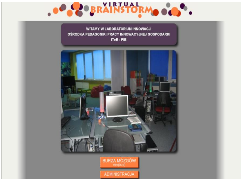
Figure 1. The login page to the VBA system