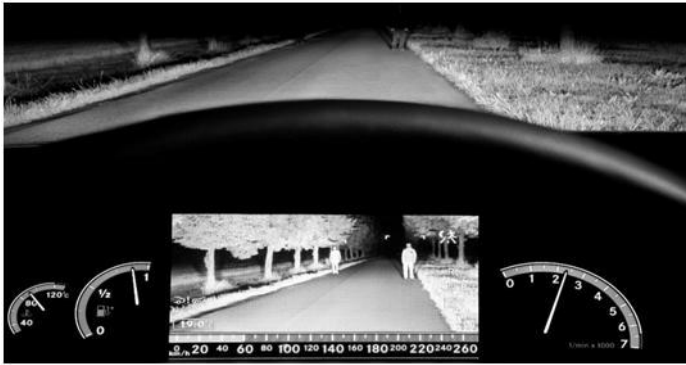
Fig. 1. Display system of vehicle equipped by night vision [Internet]