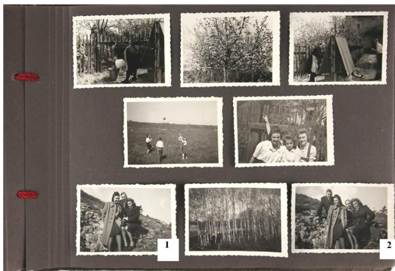
Photo 8. Comparing photographs in the family album

The photographs which are to be compared can also show differences in frames. (Photos indicated as 1 and 2 in Photo 8). This apparently tiny detail from the patient's narration may turn out significant. The arrangement of people changes when a new person appears (Photo 8). Does it mean something? We can find the answer to this question only on the basis of accompanying narration.