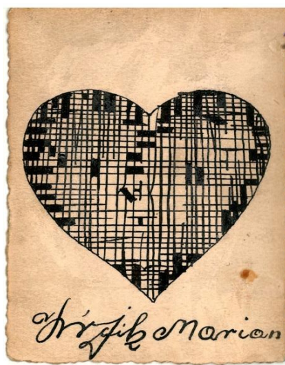
Photo 11. The reverse of the photo of a soldier