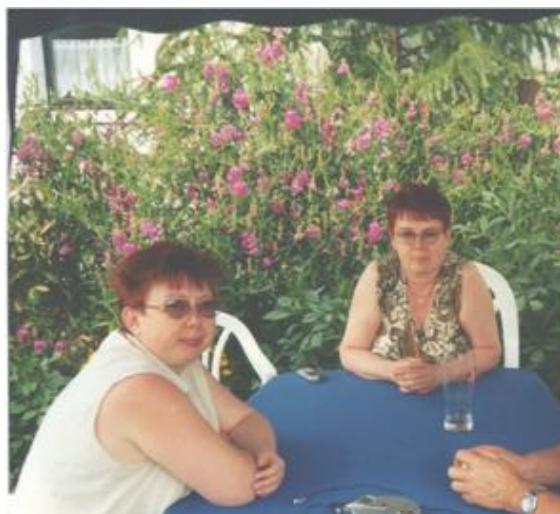
Photo 3. The photo entrusted by a patient (from the author's collection)

Similarities may refer to people, situations or the emotional climate of the photographs. Let us consider several examples. Photo 3 presents two women who are strikingly similar. The story accompanying this photograph reveals that they are a mother and an adult daughter. They are not only very similar in terms of physical appearance, but also generation differences between them are blurred (the same colour of dyed hair, similar clothes, dark glasses, etc.), which may be significant in script analysis. The woman in the background is the mother (aged 59) and the woman in the foreground is the daughter (aged 40).