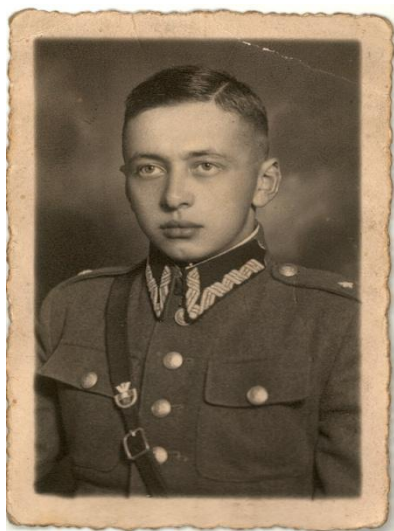
Photo 10. The photo of a soldier

Photographs sometimes hide a kind of a script secret, which can be solved only after many years. Photograph 10 was taken in 1948 in Poland. A young soldier fell in love with a slightly older girl and gave her his photograph. Then, their lives went along two separate paths. An elderly owner of the photographs claims that it has always had and still has a great influence on her life. She often looks at it and thinks of the boy who has not become her husband. In difficult moments of her life she looks at the photograph and goes back to the moment when she was loved by someone. Overleaf (Photo 11) a young soldier drew a heart and said that it contained a coded important message. The woman has not been able to decipher this intriguing message. After listening to the story, the therapist, to his amazement, solved the puzzle and read (it was enough to look at it from a certain angle): 'I remember and I love you'.