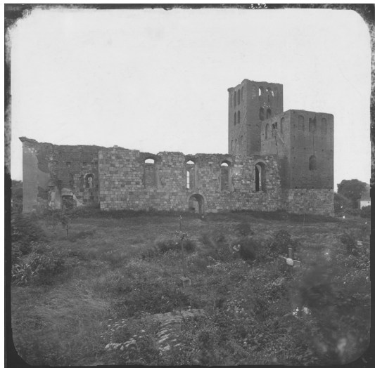
Photograph no. 521. Church of the Blessed Virgin Mary in Inowrocław, north view. Photo by Meydenlender, 1887 (Iconographic Laboratory of the Special Collections Department of the University Library in Poznań).