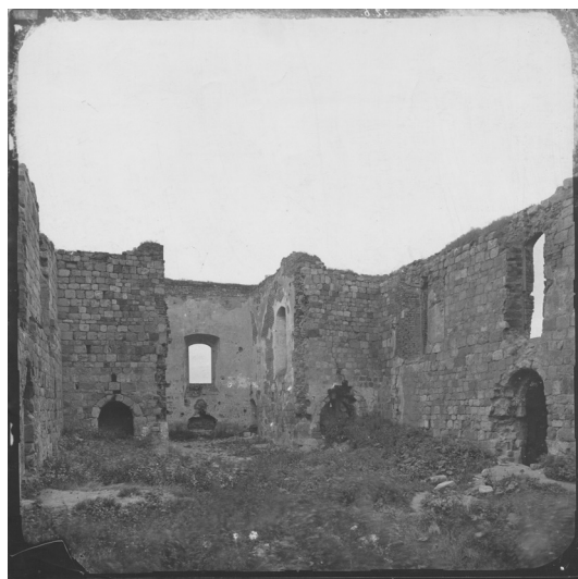
Photograph no. 524. Church of the Blessed Virgin Mary in Inowrocław, inside view of the presbytery. Photo by Meydenlender, 1887 (Iconographic Laboratory of the Special Collections Department of the University Library in Poznań).