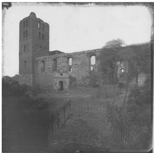
Photograph no. 522. Church of the Blessed Virgin Mary in Inowrocław, south view. Photo by Meydenlender, 1887 (Iconographic Laboratory of the Special Collections Department of the University Library in Poznań).