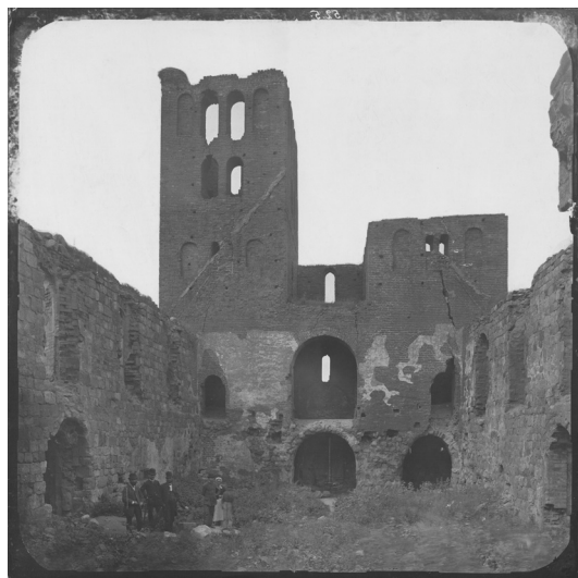
Photograph no. 523. Church of the Blessed Virgin Mary in Inowrocław, inside view of the gallery and tower. Photo by Meydenlender, 1887 (Iconographic Laboratory of the Special Collections Department of the University Library in Poznań).