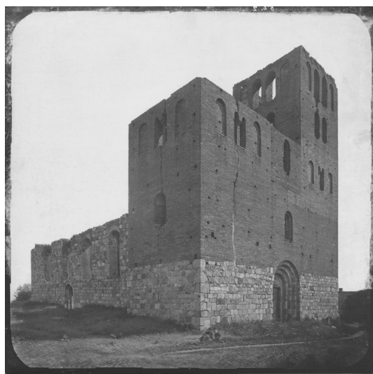
Photograph no. 520. Church of the Blessed Virgin Mary in Inowrocław, north-west view. Photo by Meydenlender, 1887 (Iconographic Laboratory of the Special Collections Department of the University Library in Poznań).