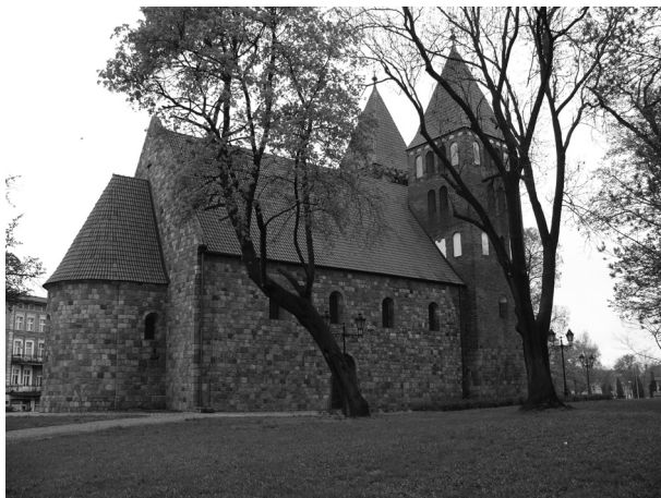
Photo 1. Church of the Blessed Virgin Mary in Inowrocław, present view.