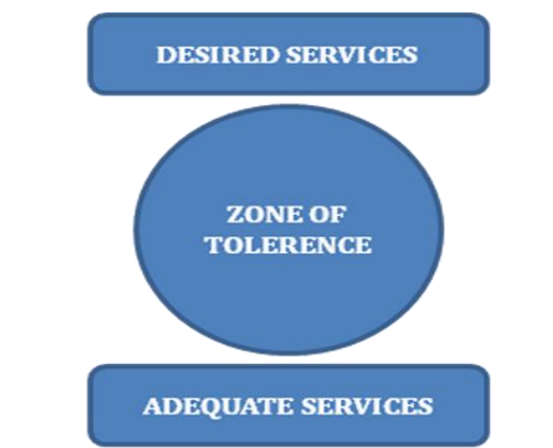
Figure 2. Zone of tolerance.

This is most critical time in hospital services since Services are heterogeneous i.e. performance of hospitals may vary across providers, across employees of same provider. The extent to which customer recognizes and are willing to accept this variation, is called Zone of tolerance. It is the range where customer does not particularly notice service performance of your hospitals. Hospital administration must try to perform better than the best during this time period. It generates customer loyalty, footfall, brand image and profit maximization.