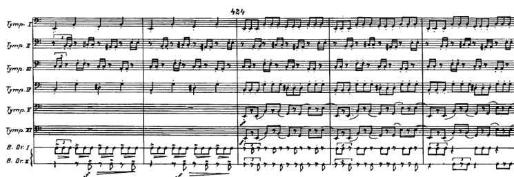
Ex. 1: H. Brian, Gothic Symphony , part VI ( Te ergo... ), bb. 422–426. A fragment for timpani and bass drums. 23