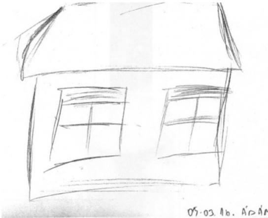
FIGURE 2. Aaron's house

Draw the House. The drawing of the house is schematic. The lines are also entangled. The house is not symmetrical.