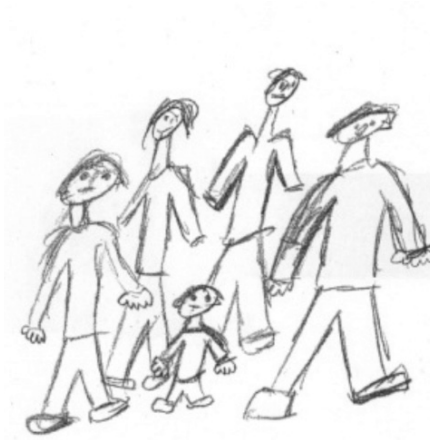
FIGURE 4. Aaron's family