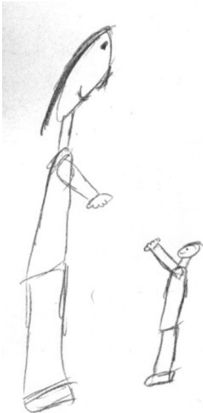
FIGURE 7. Aaron's mother – child drawing

The task is: to draw a mother with her child. This drawing points out the characteristic of the relationship between mother and her child. In the picture they reach for each other but they are not attained each other.