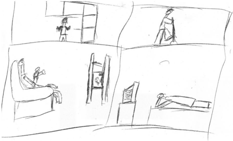
FIGURE 6. Aaron's kinetic family