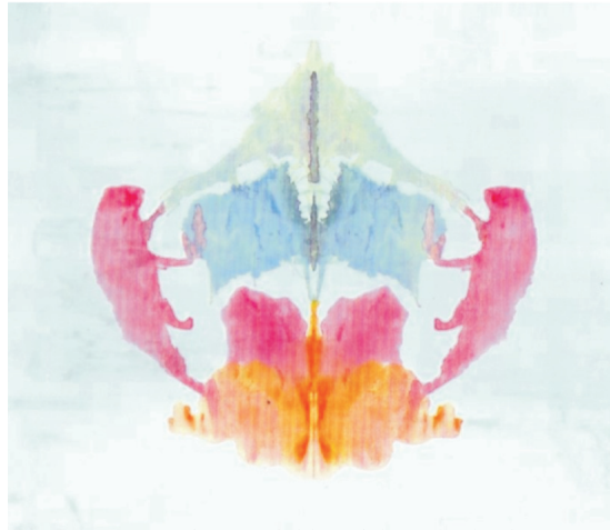
FIGURE 8. The VIIIth blot of the Rorschach Test

on the right, one on and the left side of the page, compress the butterfly with their hind legs, prevented him going away”.